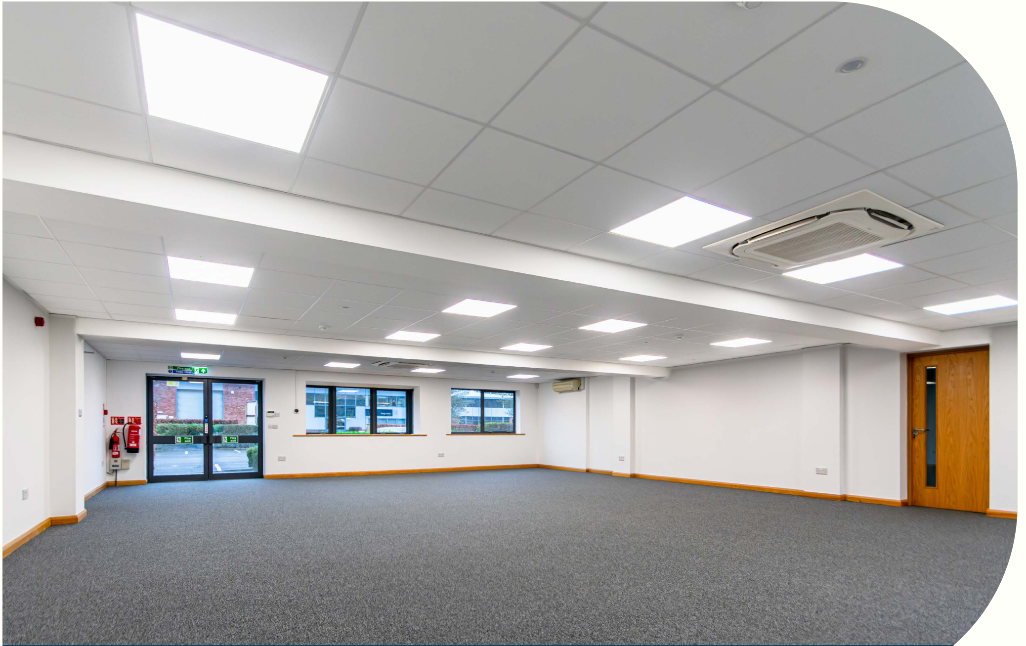
2 & 3 LAKESIDE, HEADLANDS BUSINESS PARK, SALISBURY ROAD, RINGWOOD, HAMPSHIRE, BH24 3PB