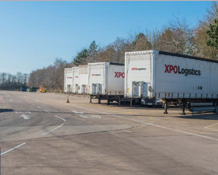
↓ HGV PARKING SPACES