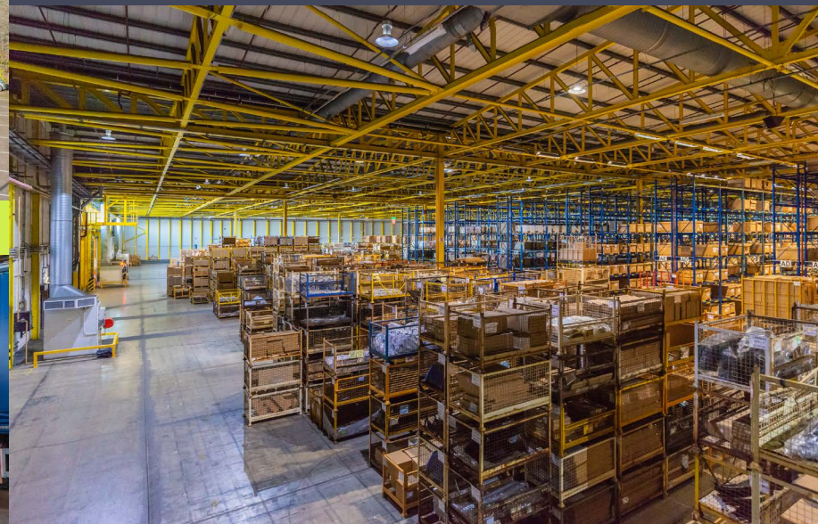
↑ 99,260 SQ FT WAREHOUSE