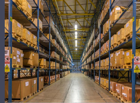
↑ SODIUM PENDANT & FLUORESCENT STRIP LIGHTING

The warehouse benefits from the following features and specification.