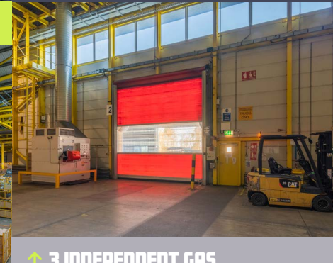
↑ 3 INDEPENDENT GAS FIRED HEATERS