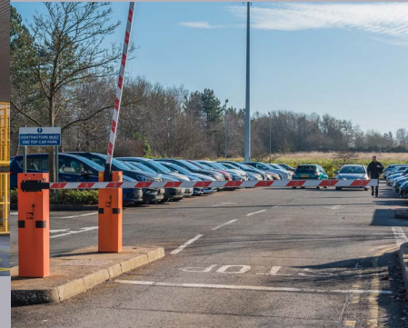
↓ SEPARATE CAR PARKING AREA