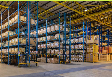
↓ PART RACKED