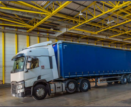
↑ 9.6M MINIMUM EAVES HEIGHT