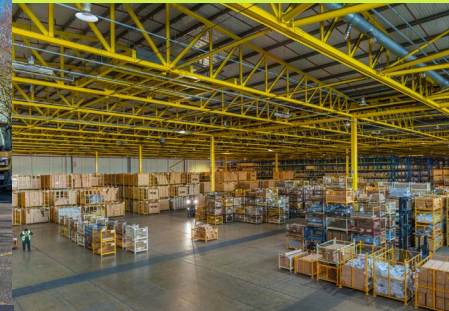
↓ SPRINKLER SYSTEM