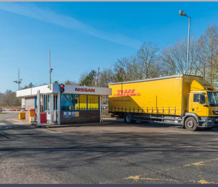
↑ 24/7 MANNED SECURITY