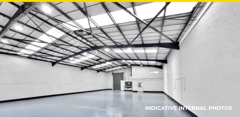
INDICATIVE INTERNAL PHOTOS