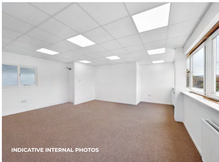
INDICATIVE INTERNAL PHOTOS