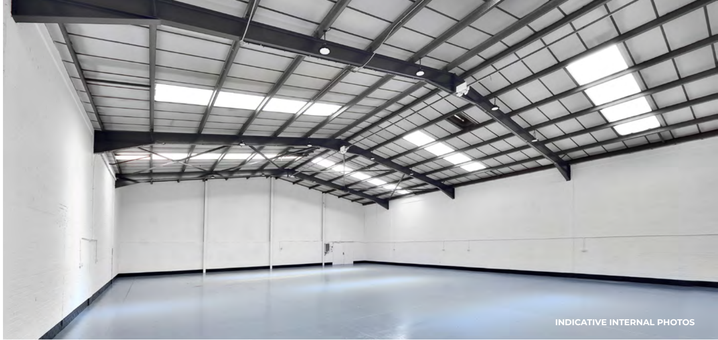
INDICATIVE INTERNAL PHOTOS