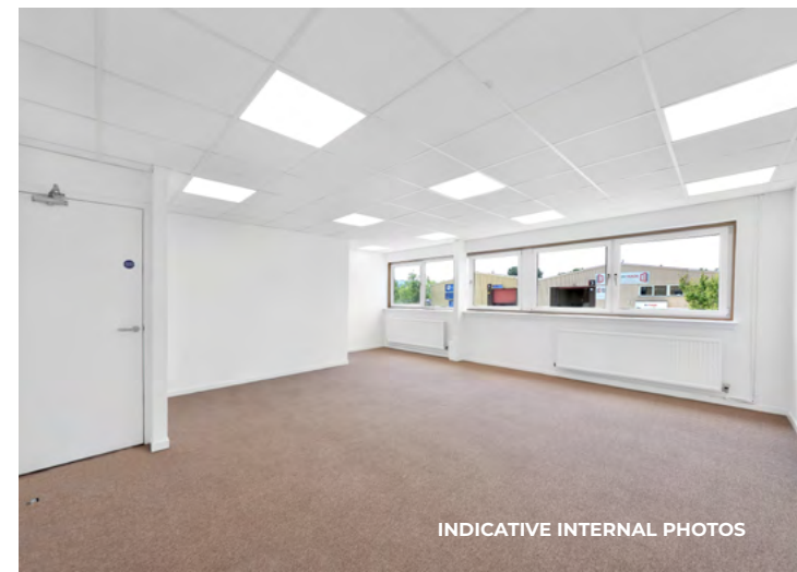
INDICATIVE INTERNAL PHOTOS