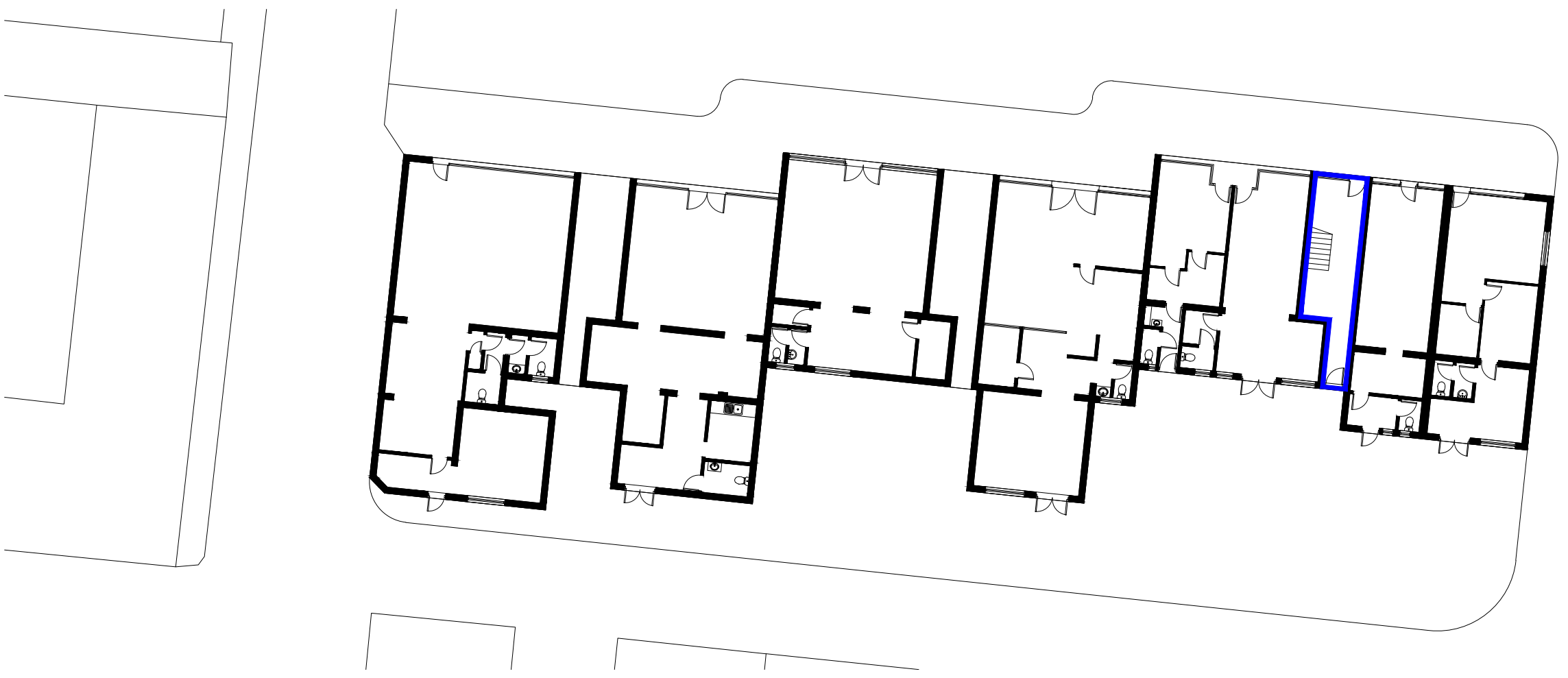
GROUND FLOOR 1:250