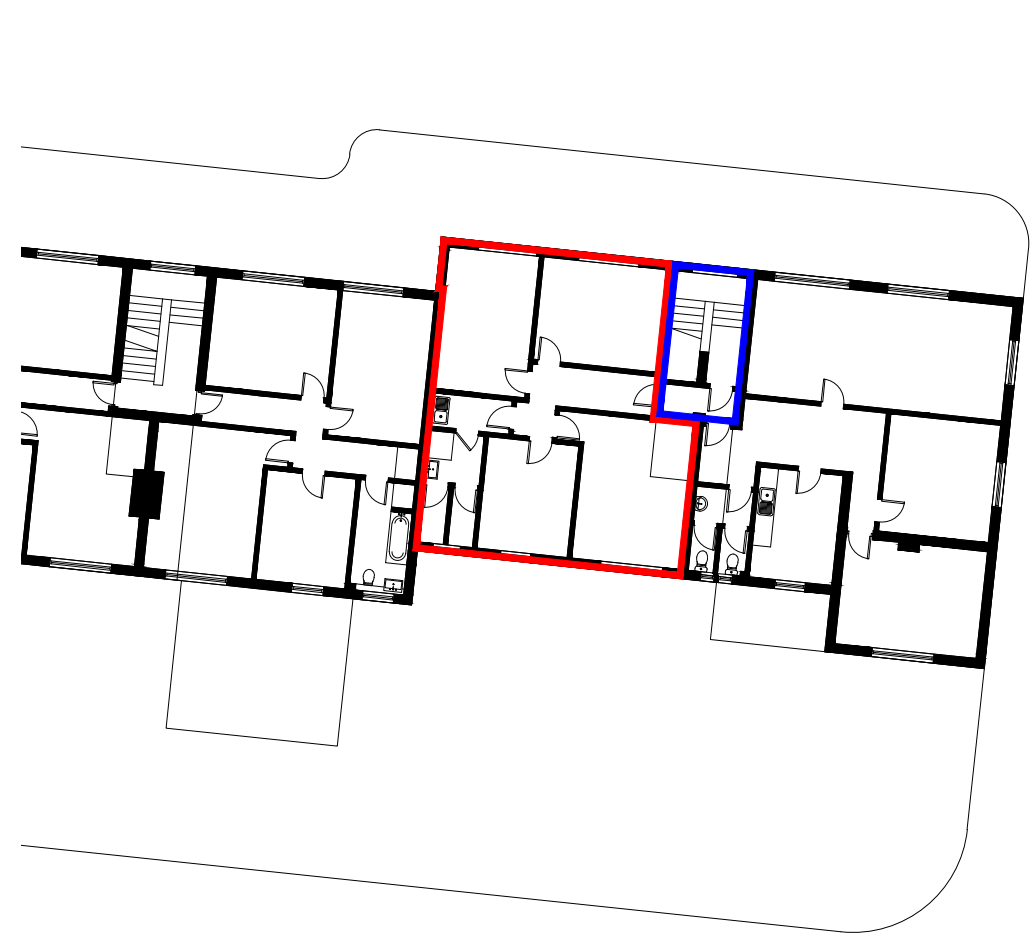
SECOND FLOOR 1:250