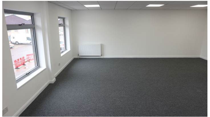
Indicative Images of similar unit