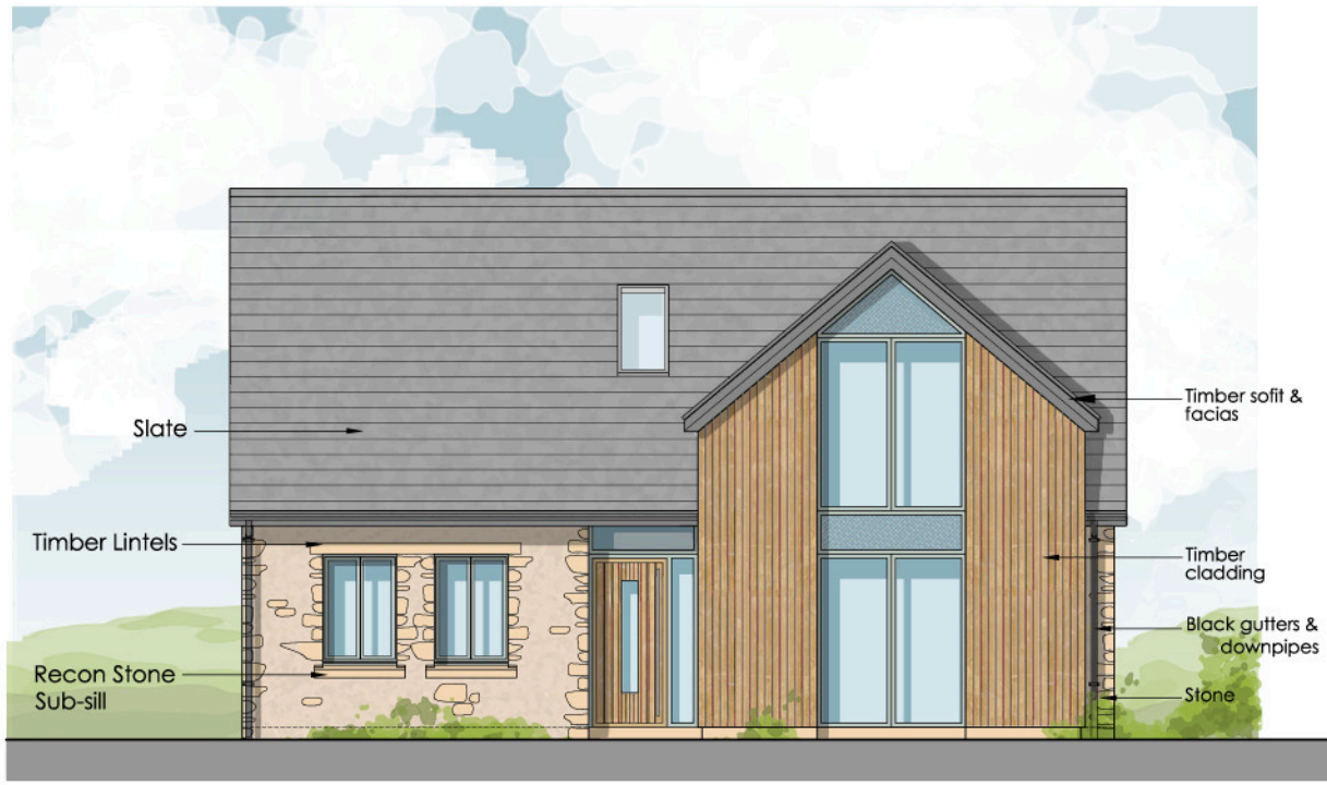
FRONT ELEVATION (proposed) - scale 1/100 0 2m 4m