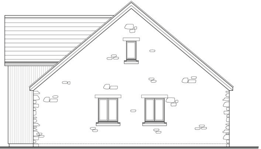
SIDE ELEVATION (proposed) - scale 1/100 0 2m 4m