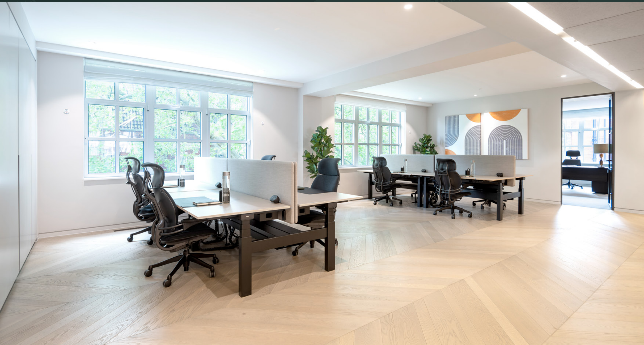
Bespoke height adjustable desking with industry leading ergonomic task chairs