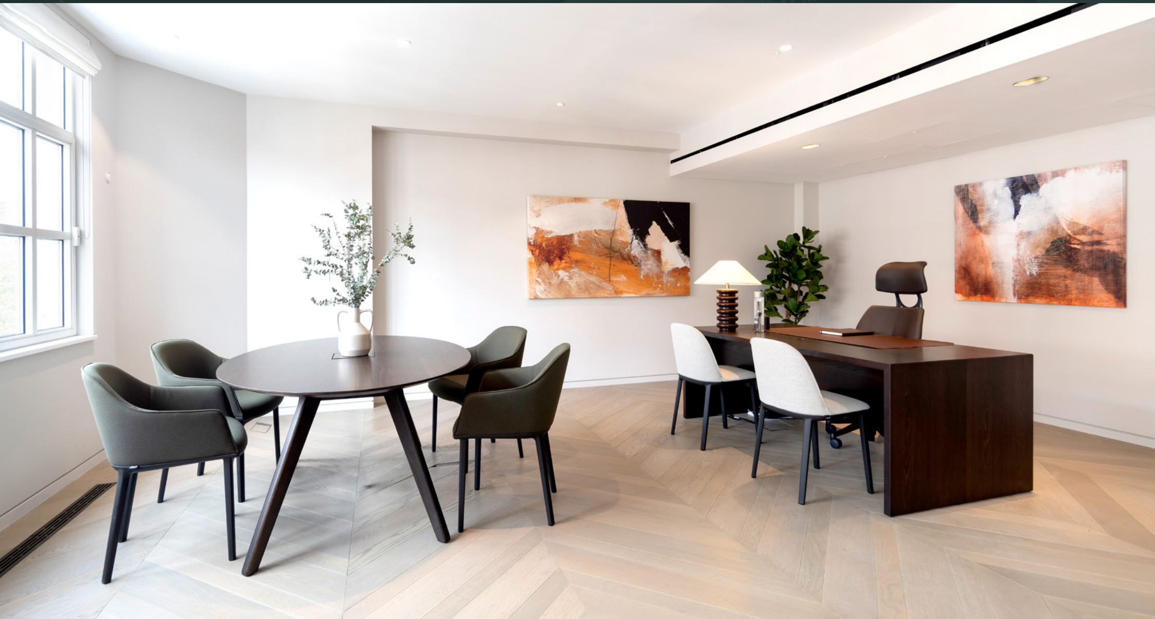
Executive office suite designed with high-end luxury tailored furnishings