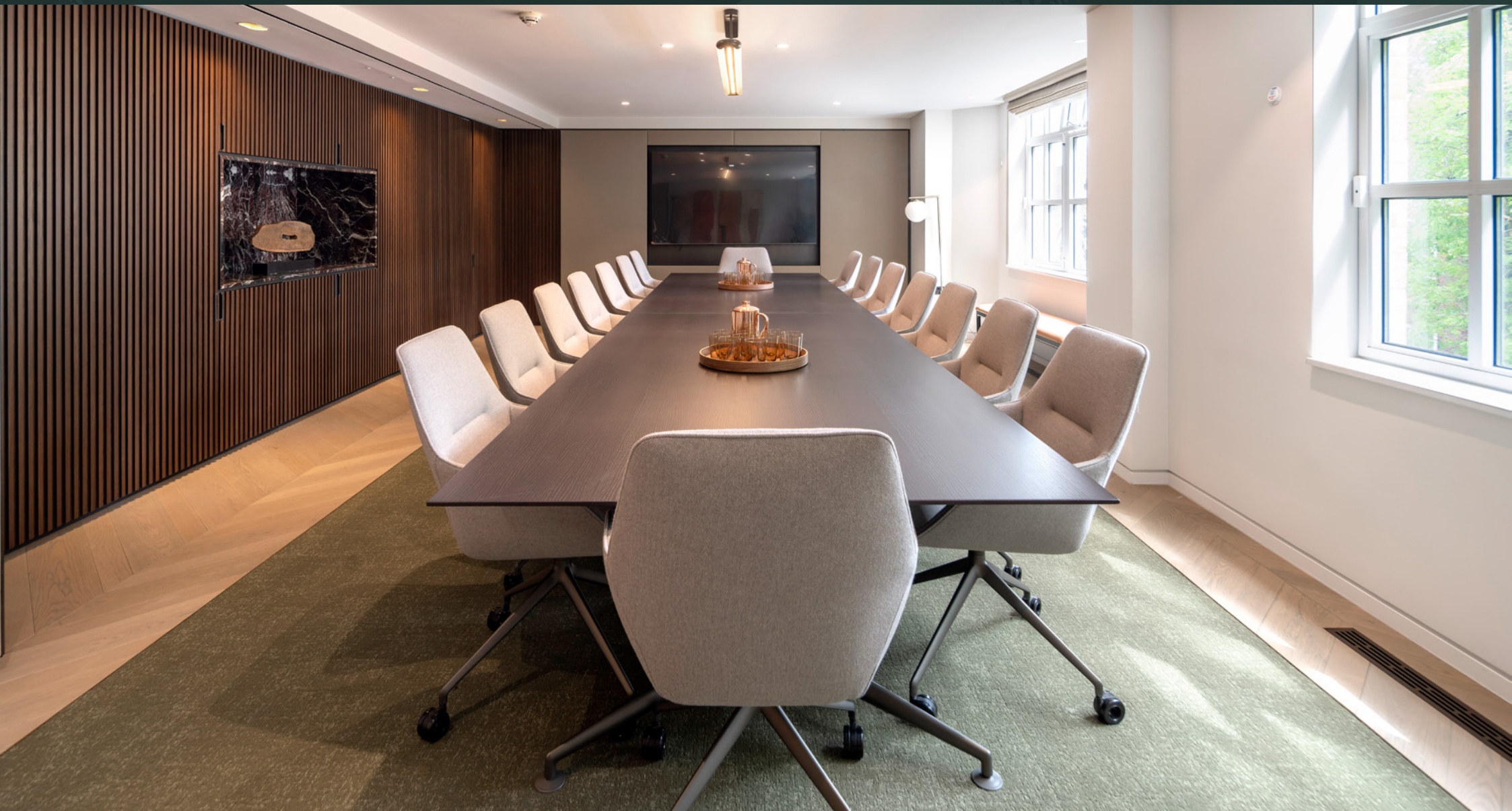
Conference table with 16x mid-back executive meeting chairs