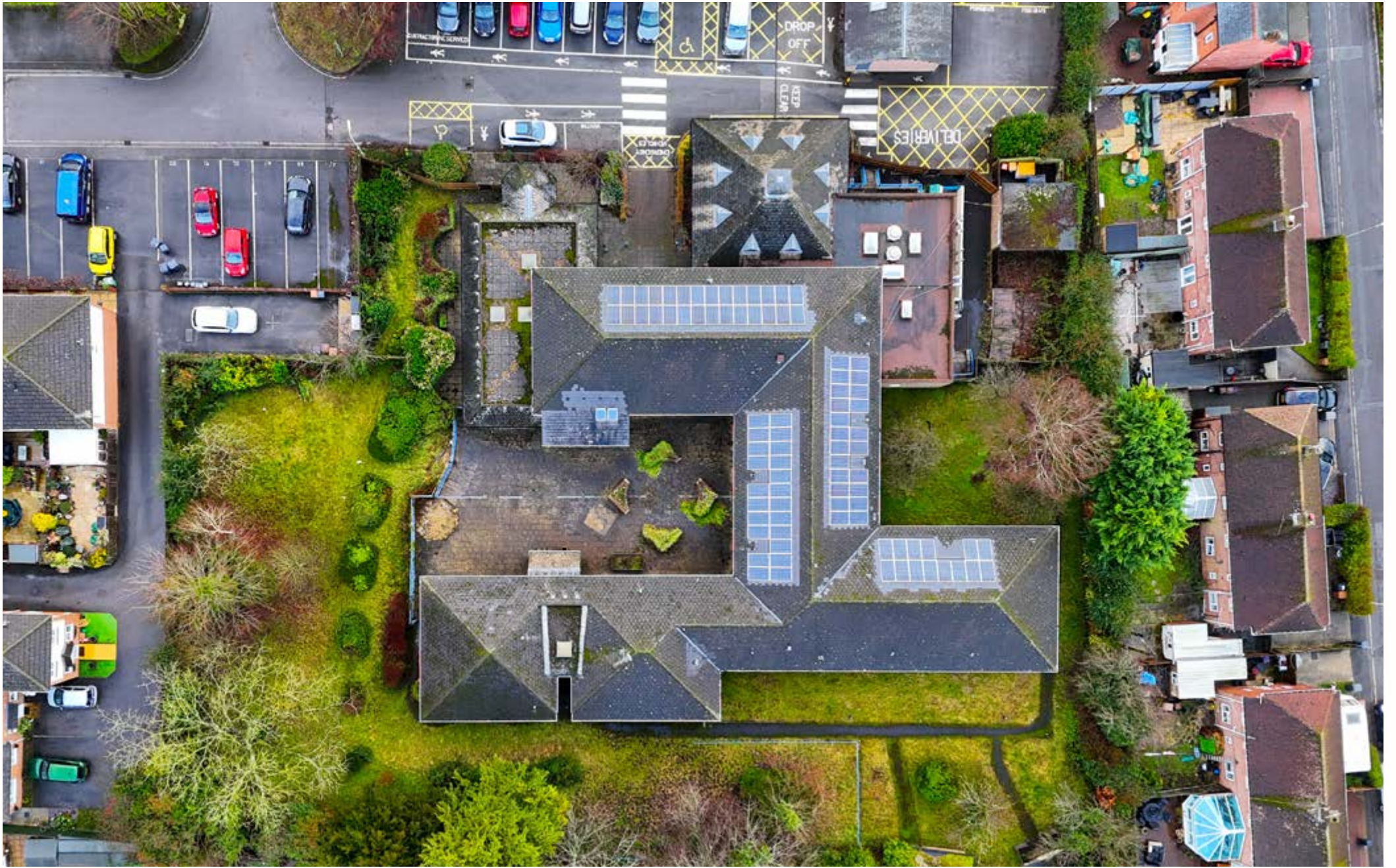
COPPER BEECHES, WOODLANDS WAY, ANDOVER, SP10 2QU