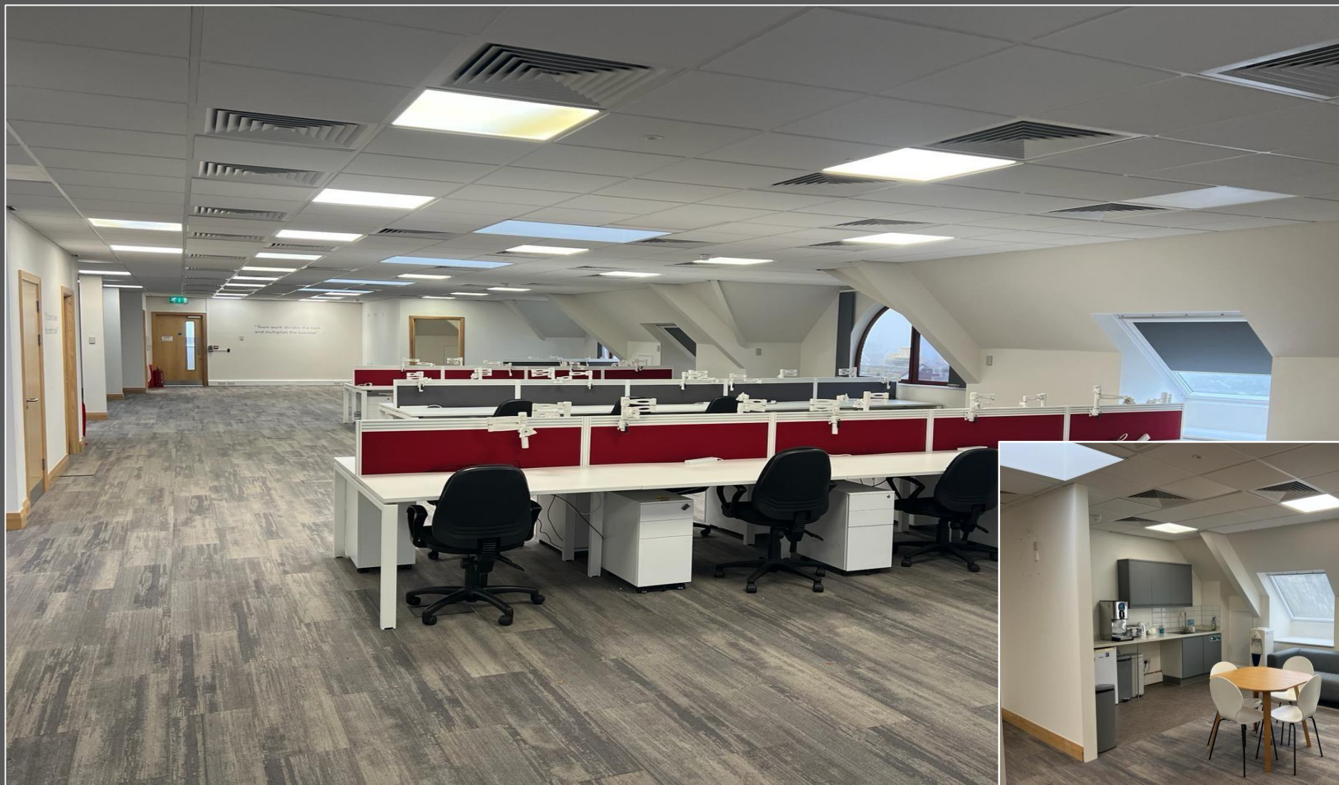
Second Floor Offices