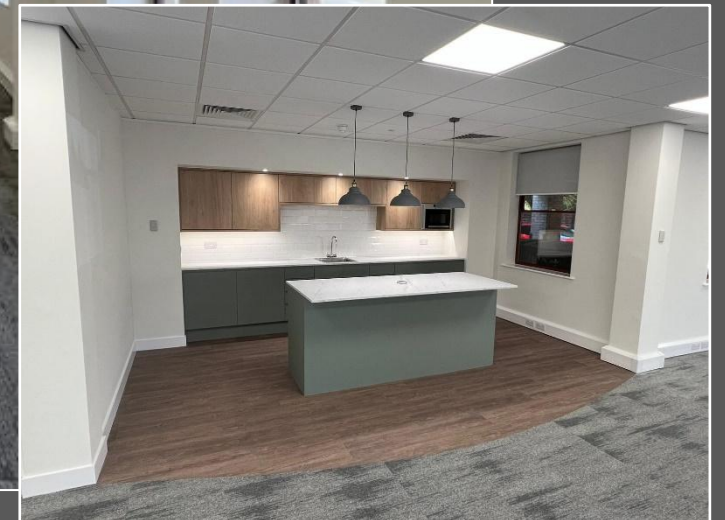
Ground Floor Offices