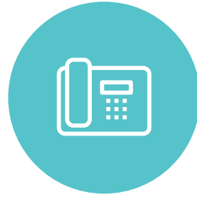
Telephone System with VOIP