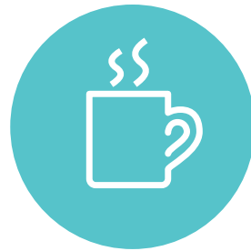
Tea & Coffee