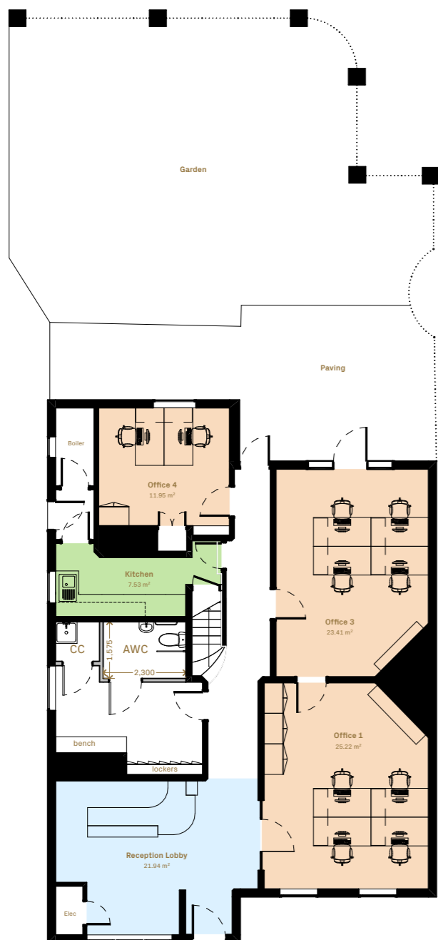
Ground Floor 1:150