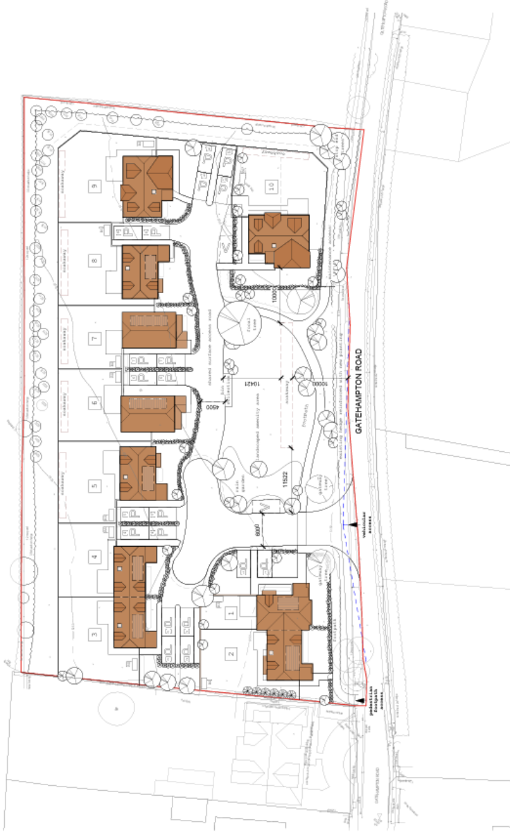
1 Proposed Block Plan 1:500

THESE REPRESENTATIONS HAVE BEEN PREPARED FOR THE PURPOSES OF THE APPLICATION ONLY AND DO NOT CONSTITUTE AN OFFER OF ANY FINANCIAL PRODUCT OR SERVICE. THE INFORMATION CONTAINED HEREIN IS FOR INFORMATION ONLY AND IS NOT INTENDED TO BE USED AS A BASIS FOR INVESTMENT OR AS A BASIS FOR MAKING ANY OTHER DECISION. THE INFORMATION CONTAINED HEREIN IS NOT INTENDED TO BE USED AS A BASIS FOR MAKING ANY OTHER DECISION. THE INFORMATION CONTAINED HEREIN IS NOT INTENDED TO BE USED AS A BASIS FOR MAKING ANY OTHER DECISION.