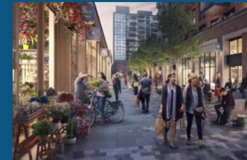
Nicholson Quarter development (CGI)