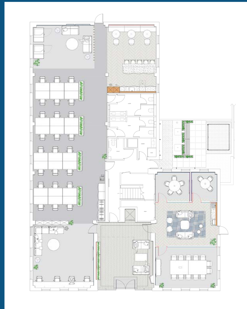
Ground floor plan 3,030 sq ft (281.49 sq m)

For indicative purposes only. Not to scale.