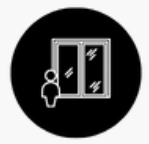
FLOOR TO CEILING GLAZING