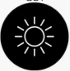
EXCELLENT NATURAL LIGHT