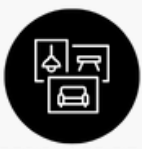
DESIGN LED FIT-OUT