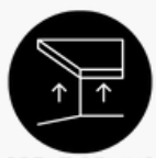
GREAT CEILING HEIGHTS