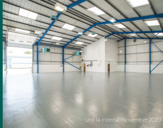
Unit 14 Internal - November 2020