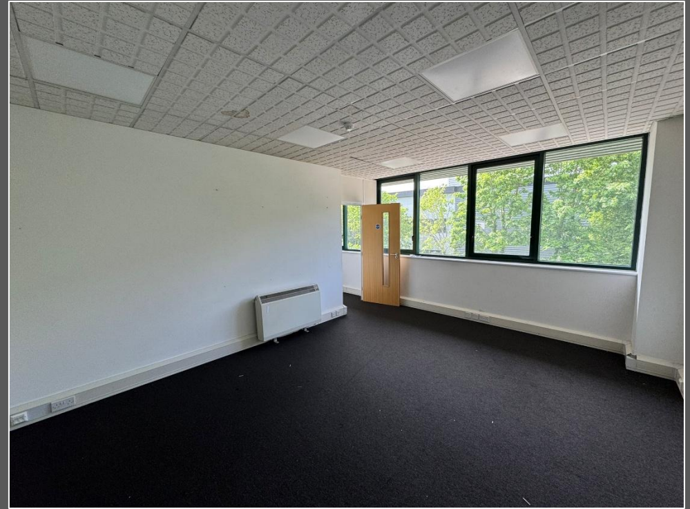
Images taken prior to refurbishment