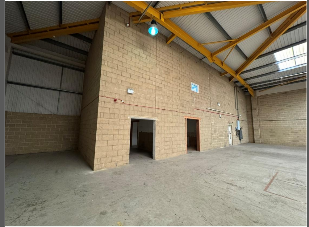
Images taken prior to refurbishment