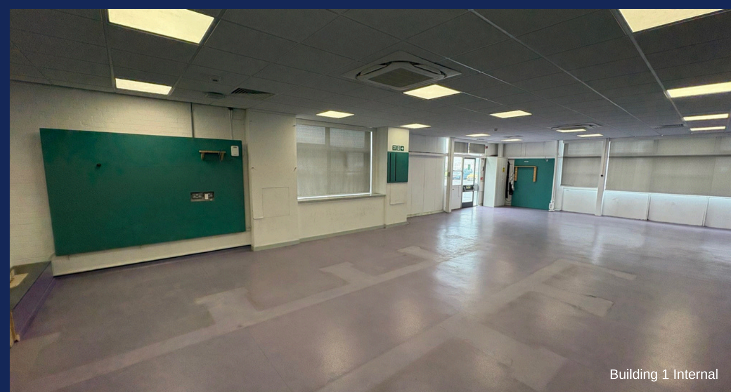
Building 1 Internal

Interested parties are to make their own enquiries.