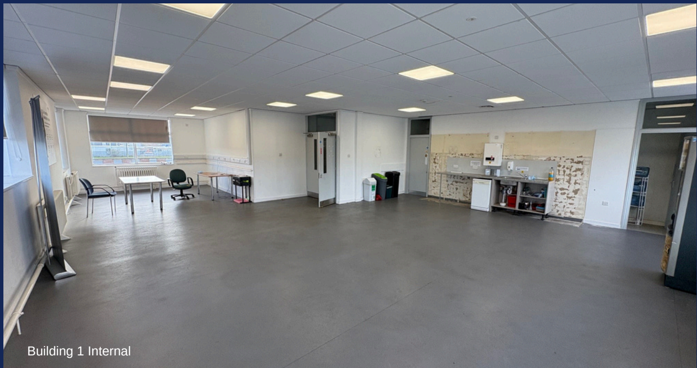
Building 1 Internal

Each party to bear their own legal costs.