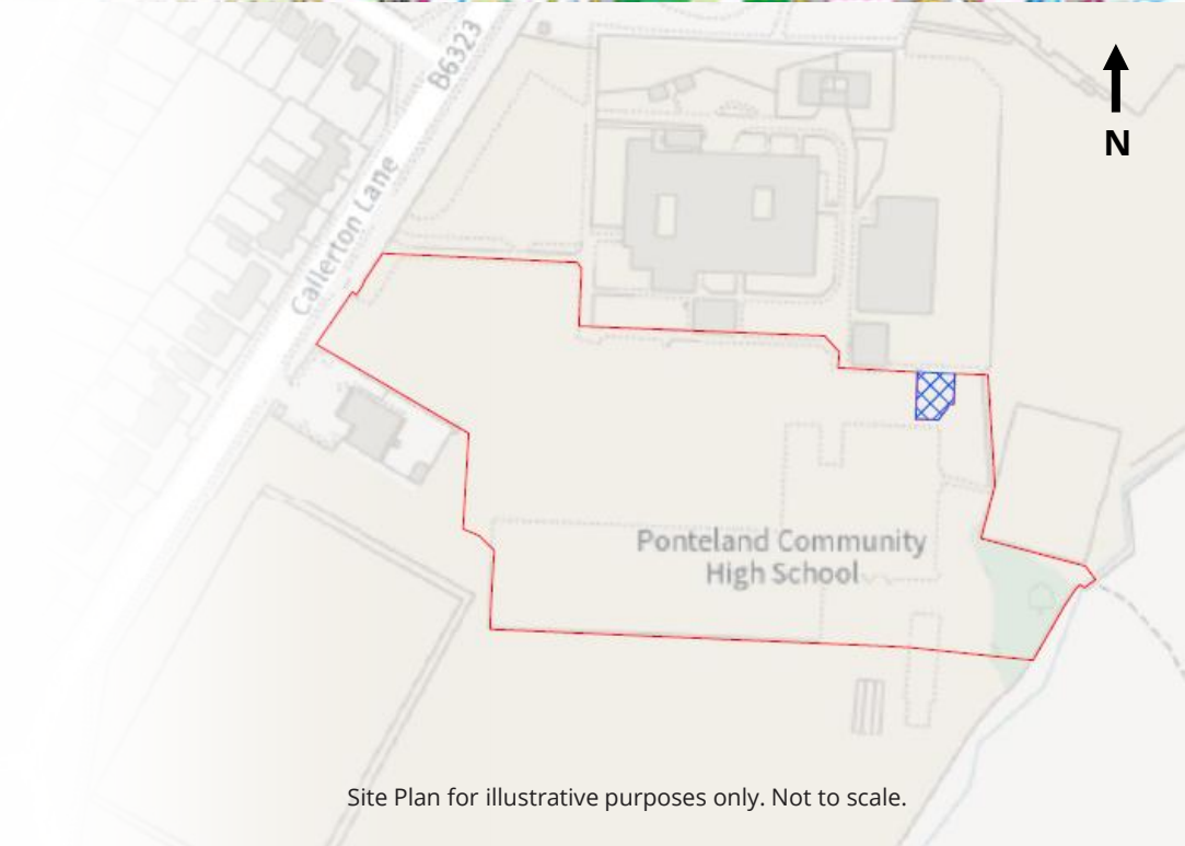
Site Plan for illustrative purposes only. Not to scale.