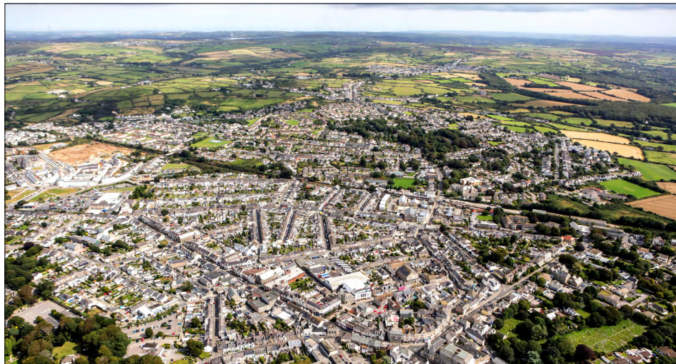
CAMBORNE FROM THE AIR

Pool lies under the authority of Cornwall Council and is situated at the northern edge of a conurbation comprising Camborne, Pool and Redruth. The Camborne-Pool-Redruth (CPR) urban area (which includes the satellite villages) has been the focus of significant investment over the last 10 years to improve infrastructure, housing, employment and leisure opportunities and is now the largest urban and industrial area in Cornwall with a population of circa 45,200 (2011 census).