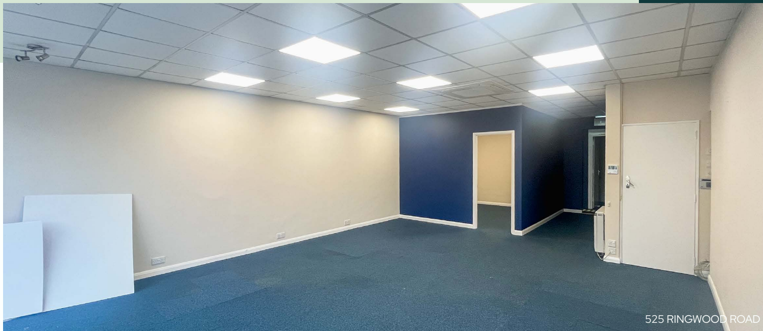
525 RINGWOOD ROAD