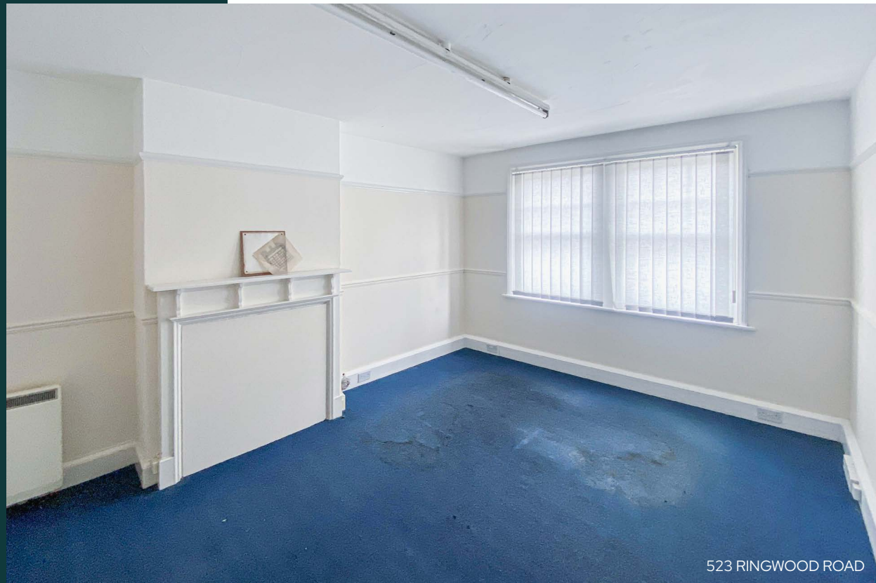
523 RINGWOOD ROAD