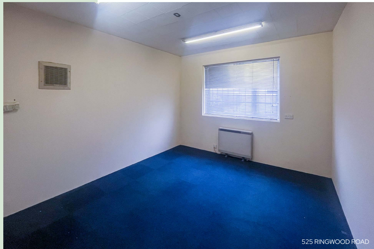
525 RINGWOOD ROAD