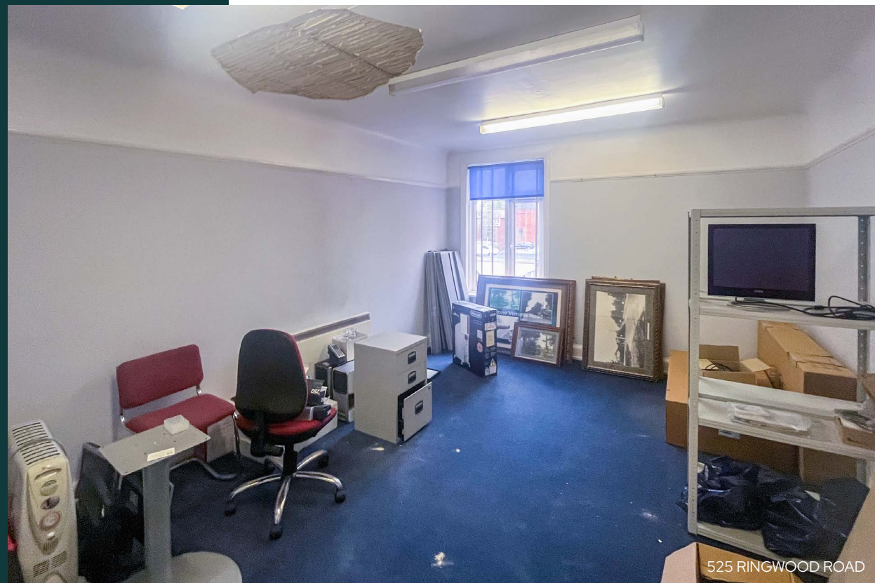
525 RINGWOOD ROAD