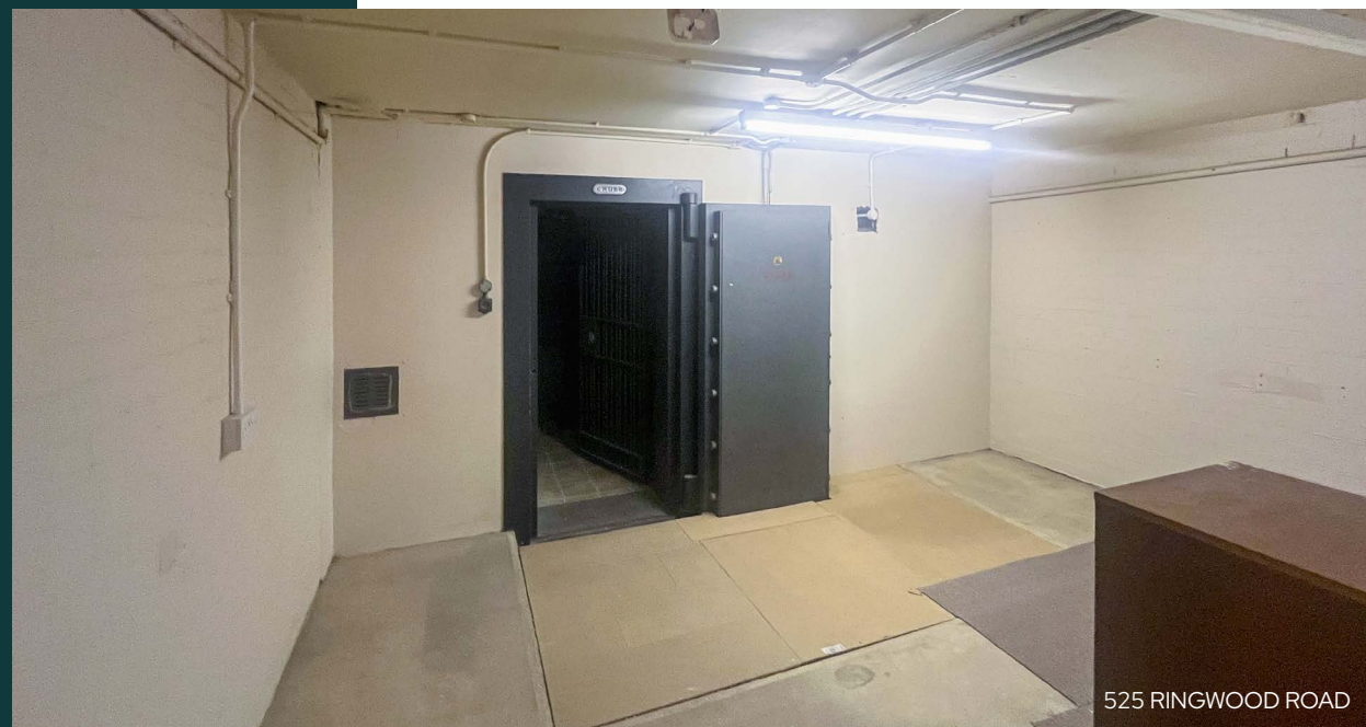
525 RINGWOOD ROAD