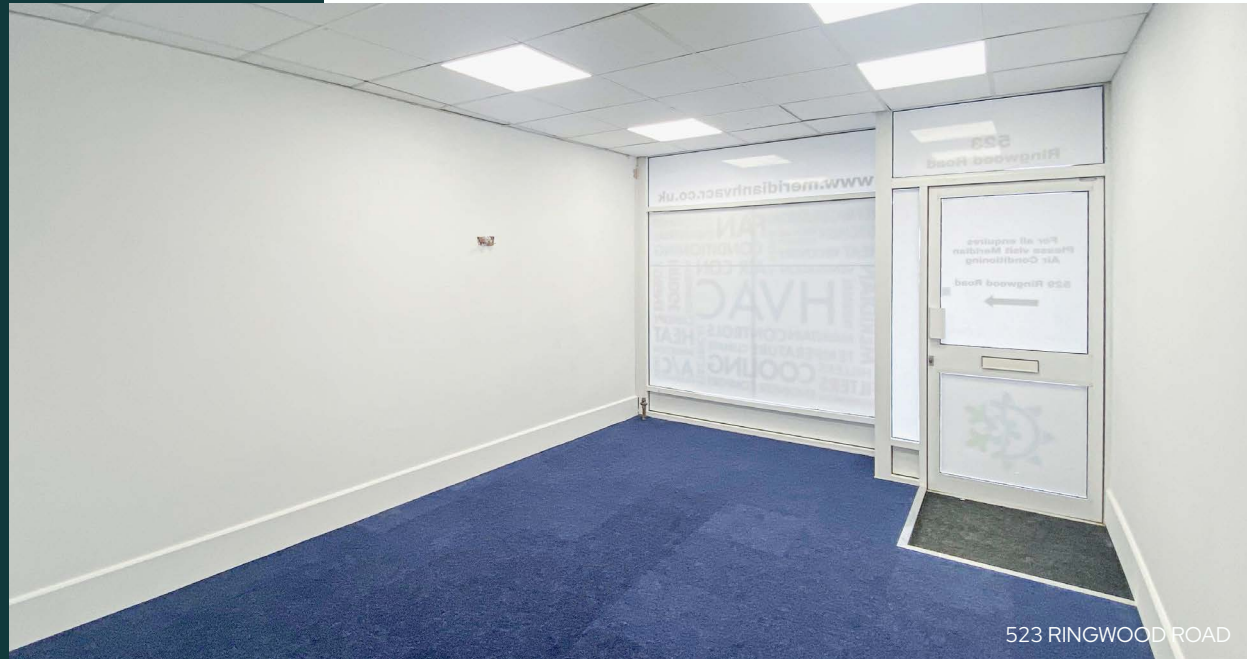
523 RINGWOOD ROAD