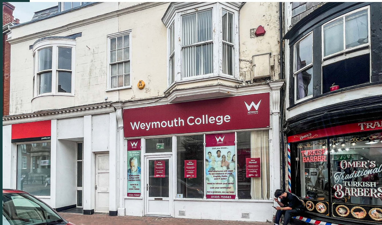
Coburg Place Entrance