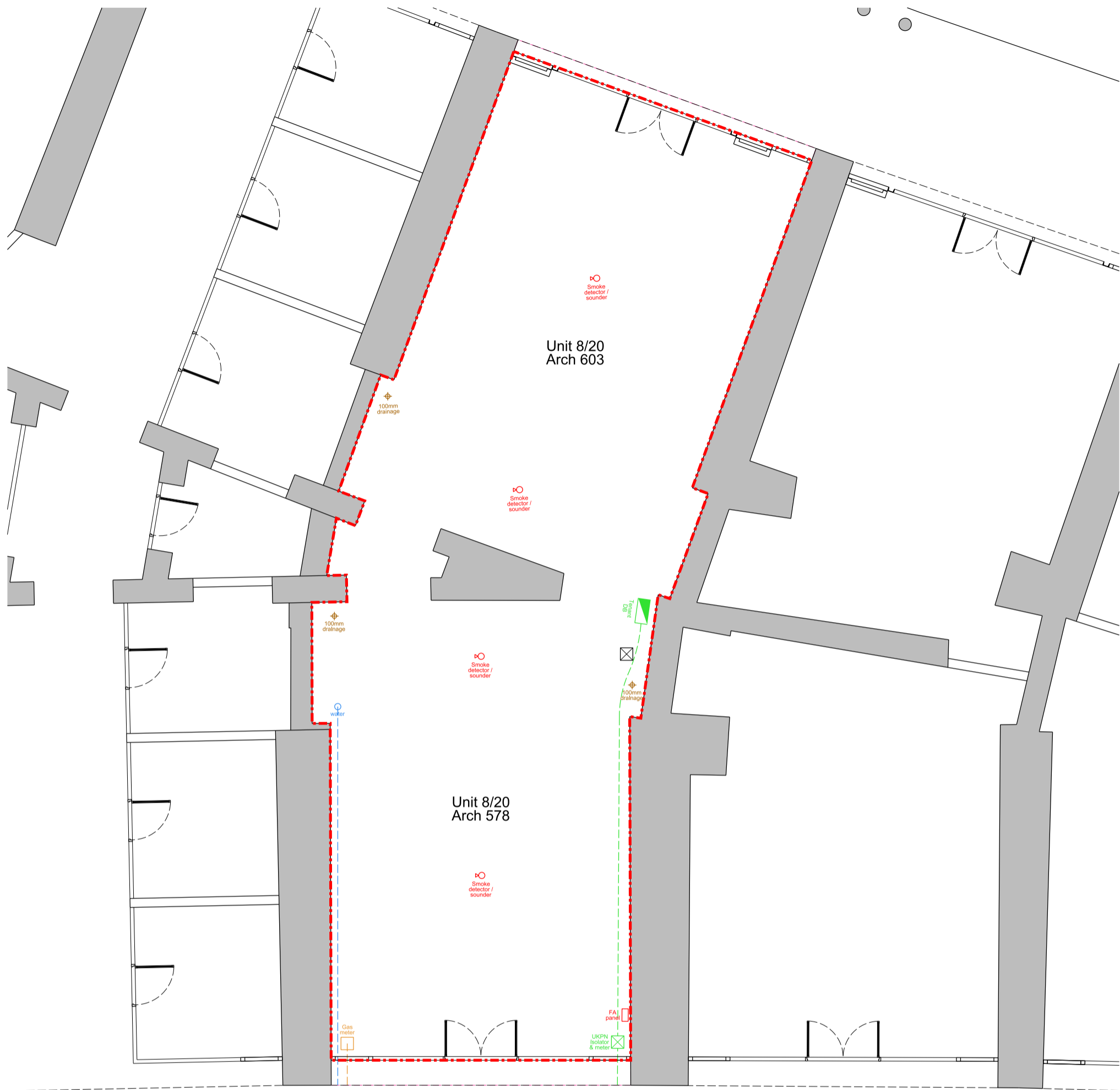
1. Unit Plan