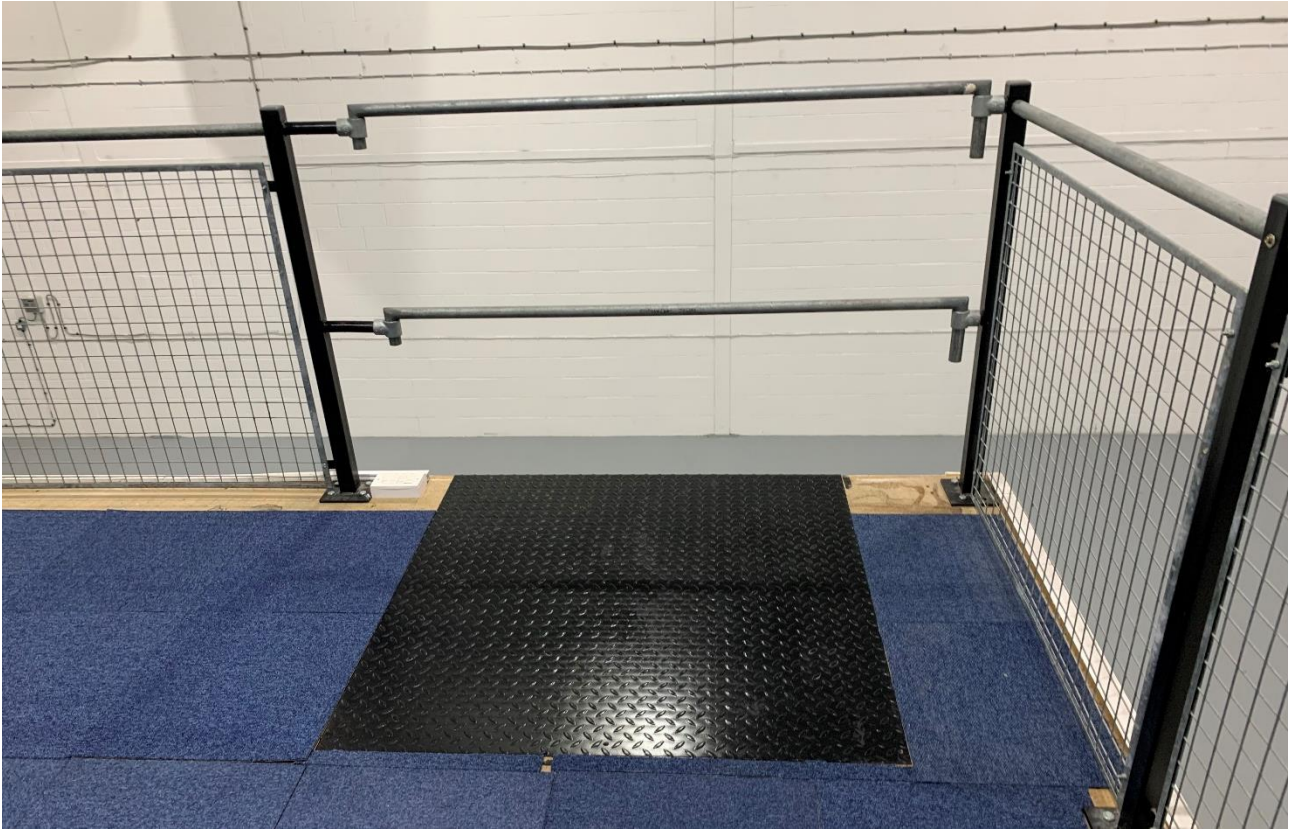
First Floor Office