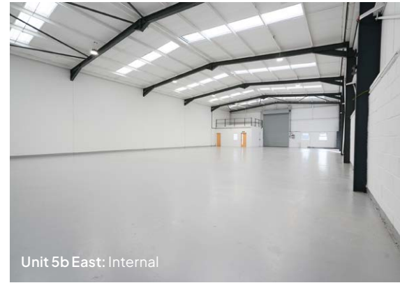
Unit 5b East: Internal