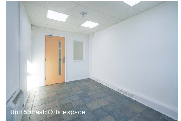
Unit 5b East: Office space