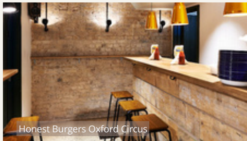
Honest Burgers Oxford Circus