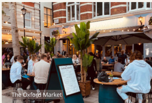
The Oxford Market