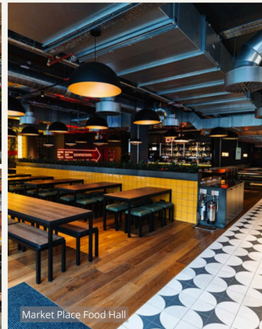
Market Place Food Hall