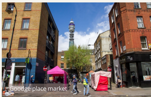
Goodge place market