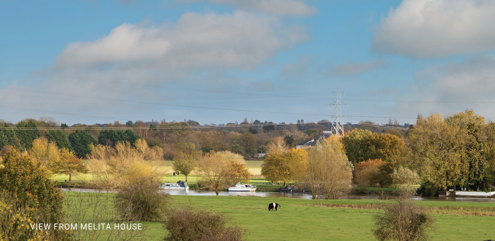
VIEW FROM MELITA HOUSE