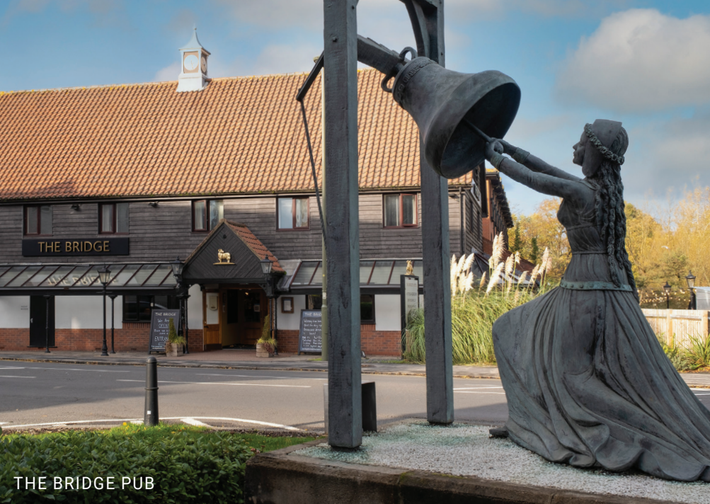
THE BRIDGE PUB