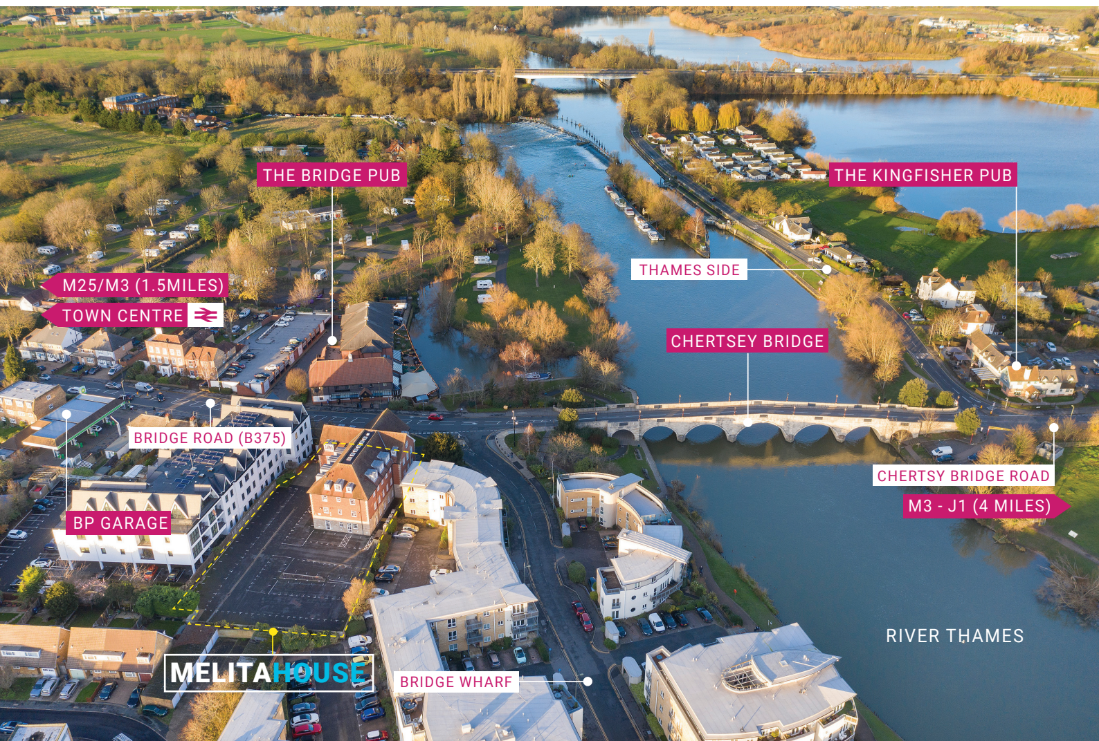
THE BRIDGE PUB