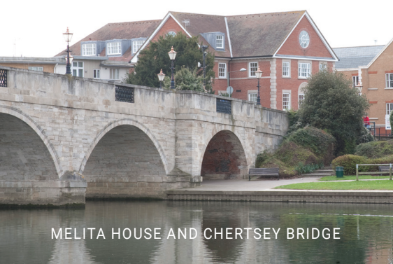
MELITA HOUSE AND CHERTSEY BRIDGE