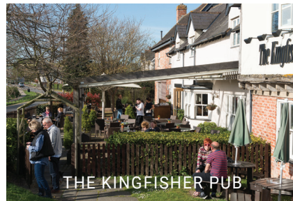
THE KINGFISHER PUB