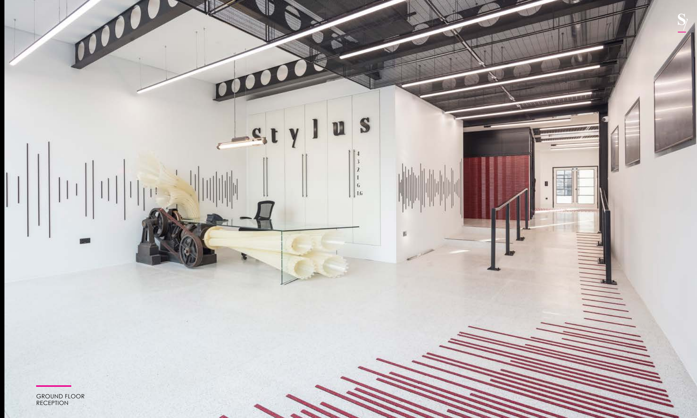
GROUND FLOOR RECEPTION

The building's original lift motor has been beautifully repurposed, combined with a floating glass desk surface and a distinctive gramophone-like sculpture which has been 3D printed from a sustainable organic bioplastic.