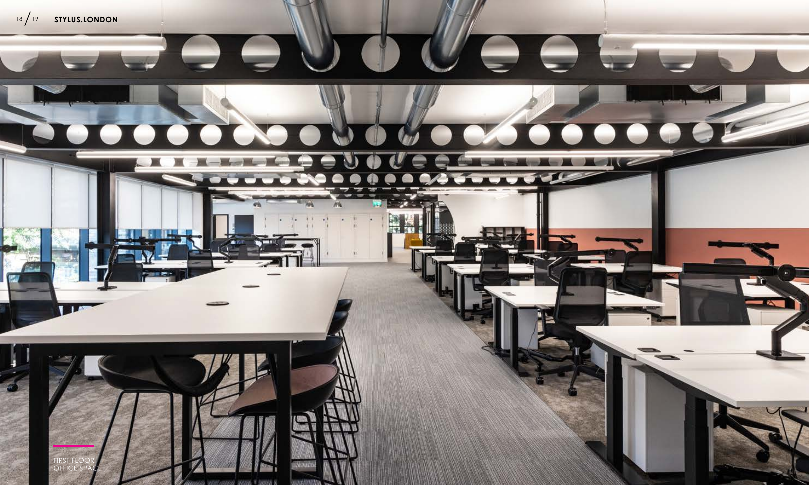
FIRST FLOOR OFFICE SPACE