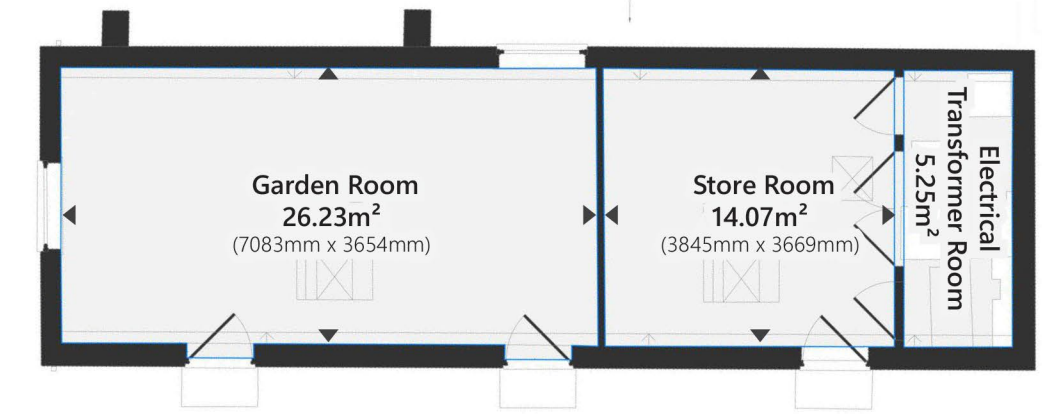
Garden/Utility Building 45.55m 2