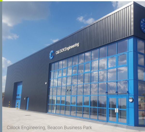
Cillock Engineering, Beacon Business Park