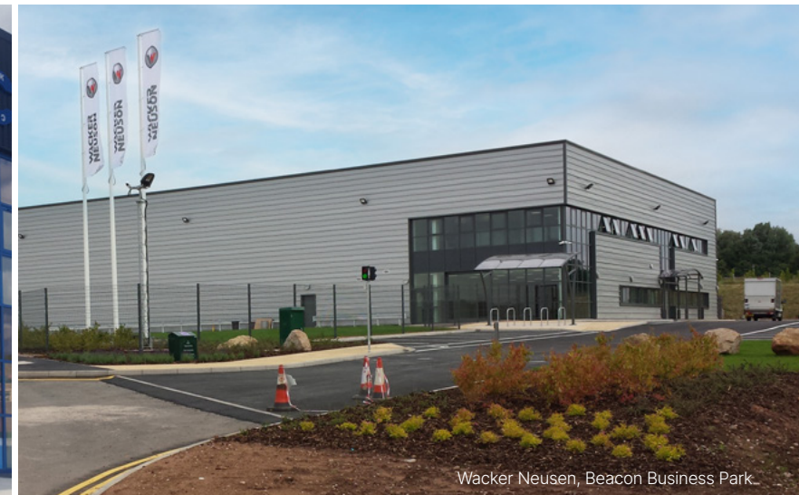
Wacker Neusen, Beacon Business Park