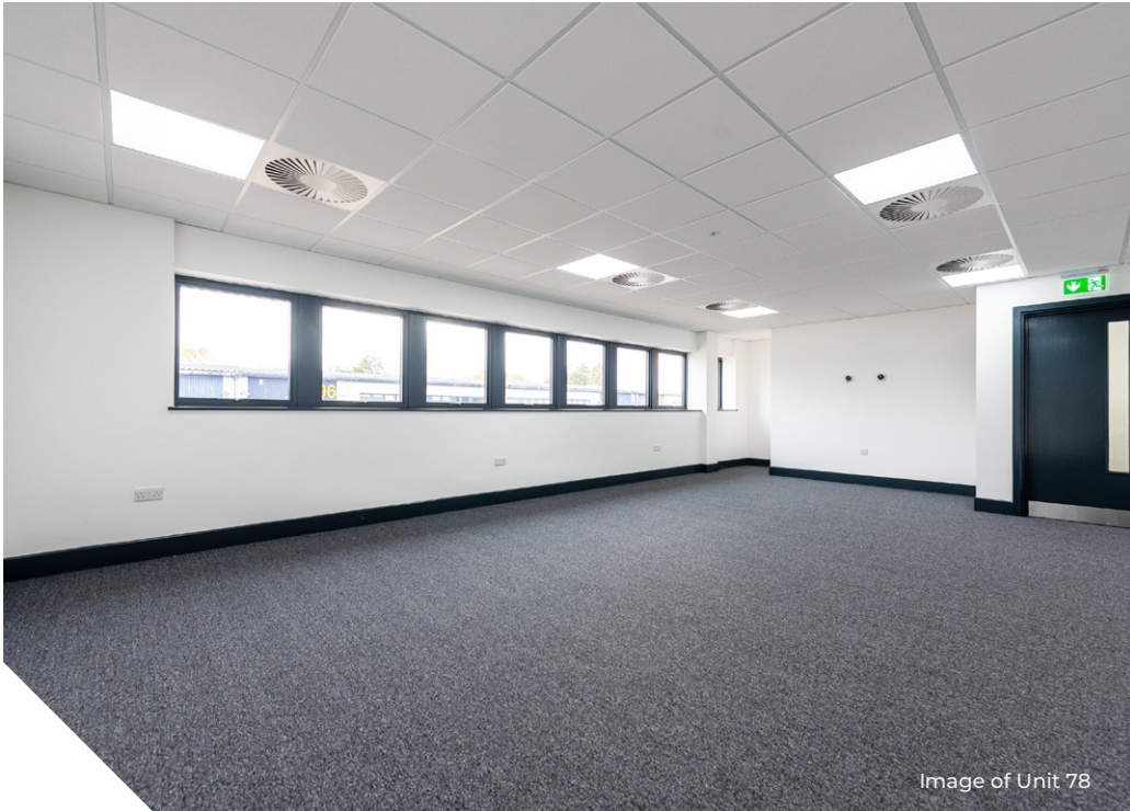
Image of Unit 78