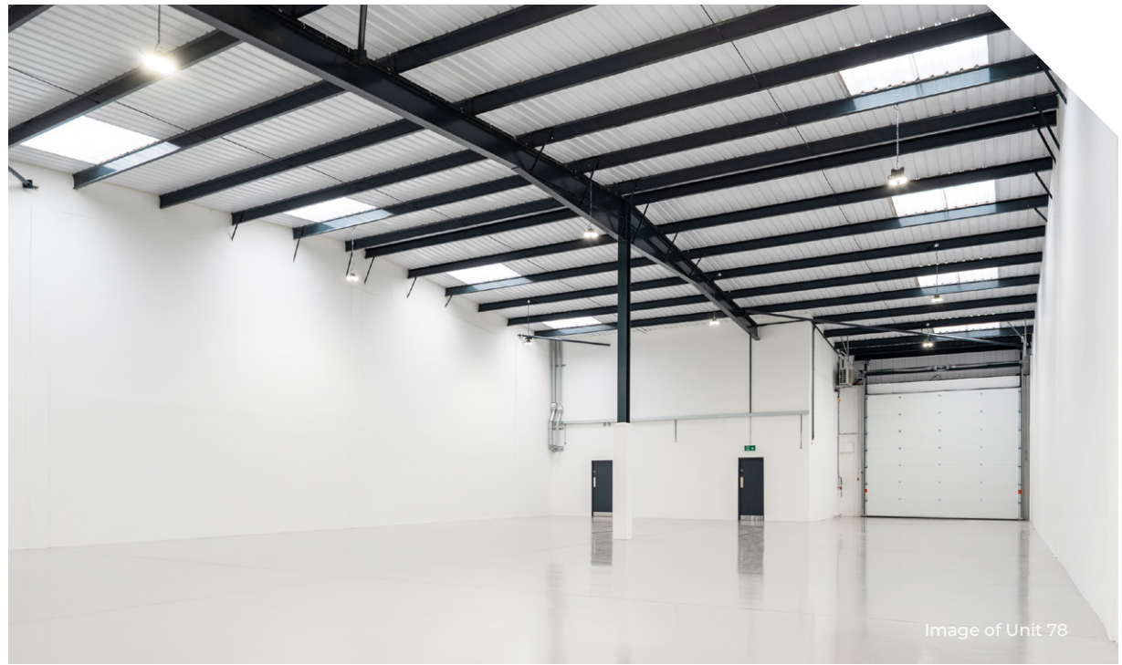
Image of Unit 78