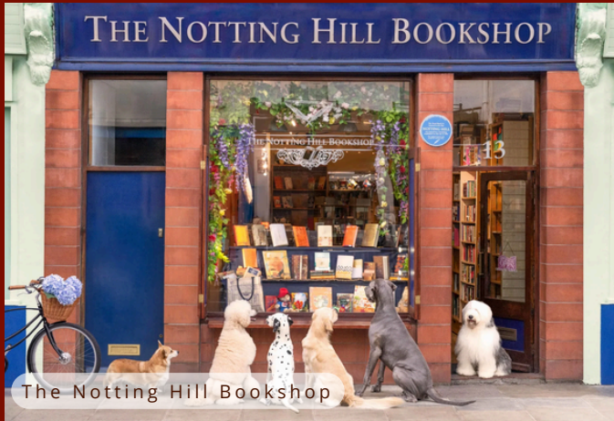
The Notting Hill Bookshop