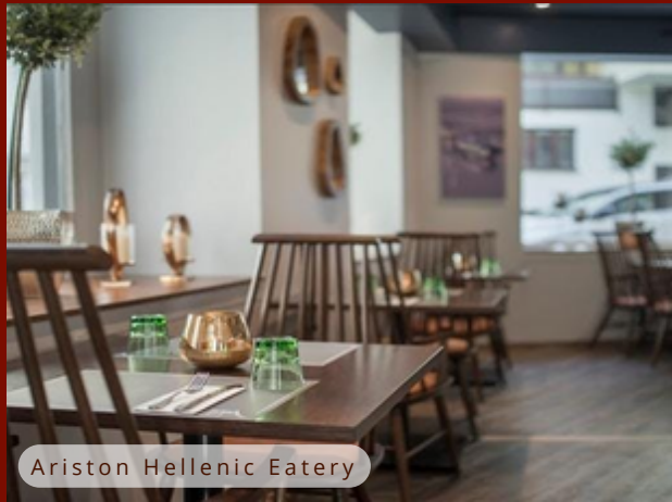
Ariston Hellenic Eatery