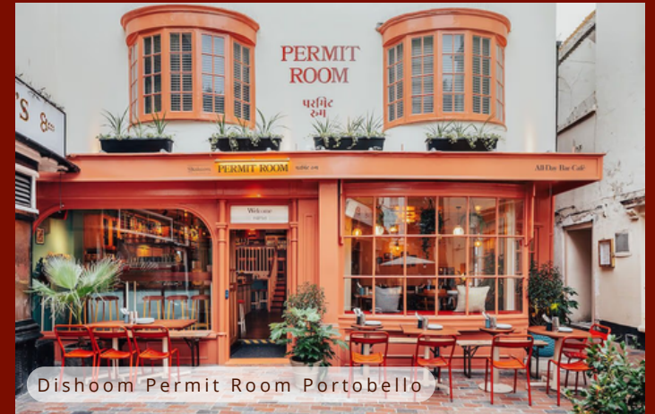
Dishoom Permit Room Portobello