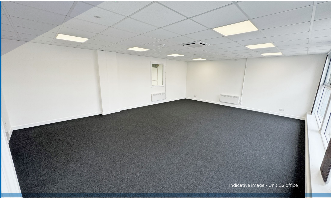
Indicative image - Unit C2 office

New EPCs will be available following refurbishment – further details available from the agents.