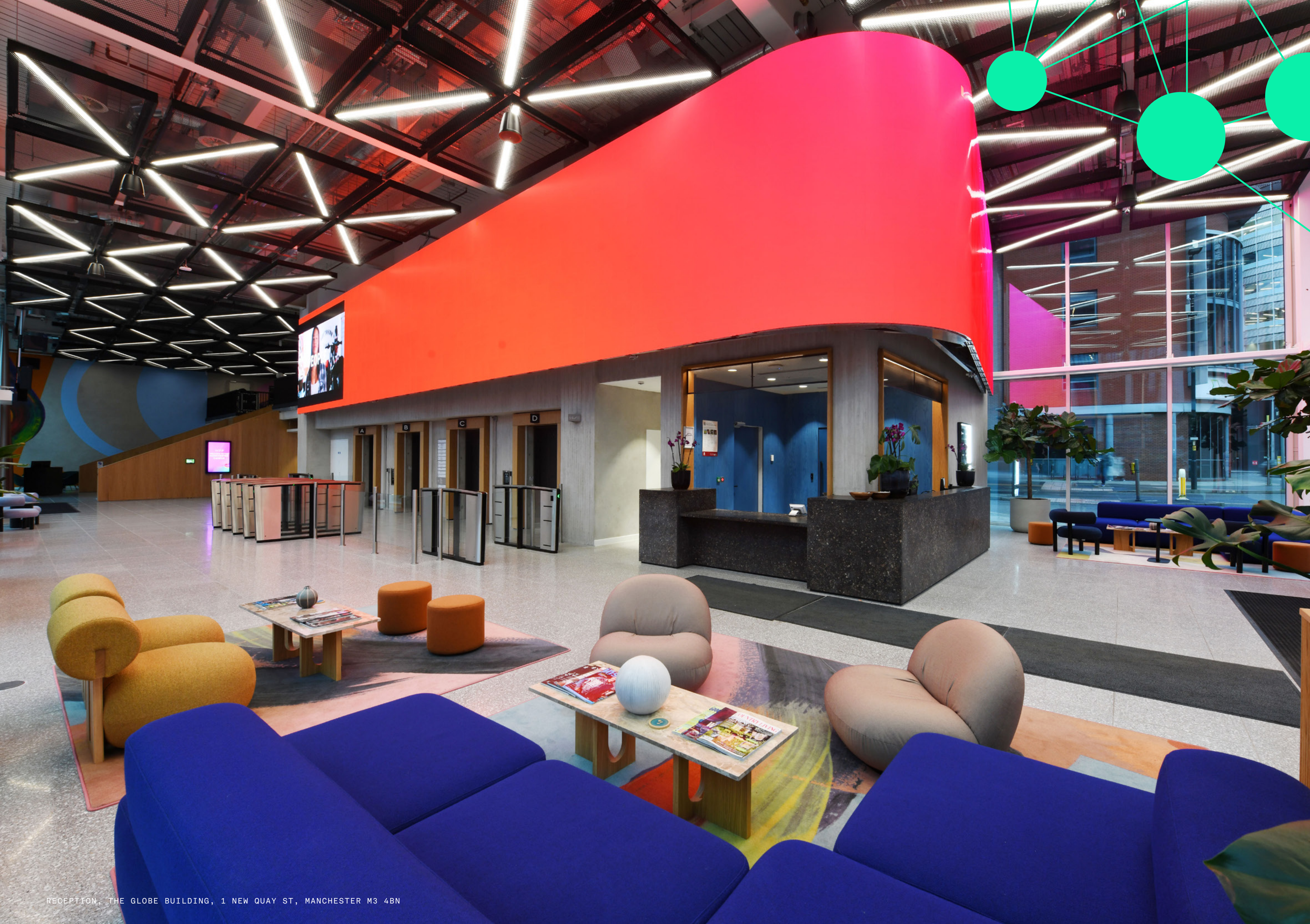
RECEPTION, THE GLOBE BUILDING, 1NEW QUAY ST, MANCHESTER M3 4BN