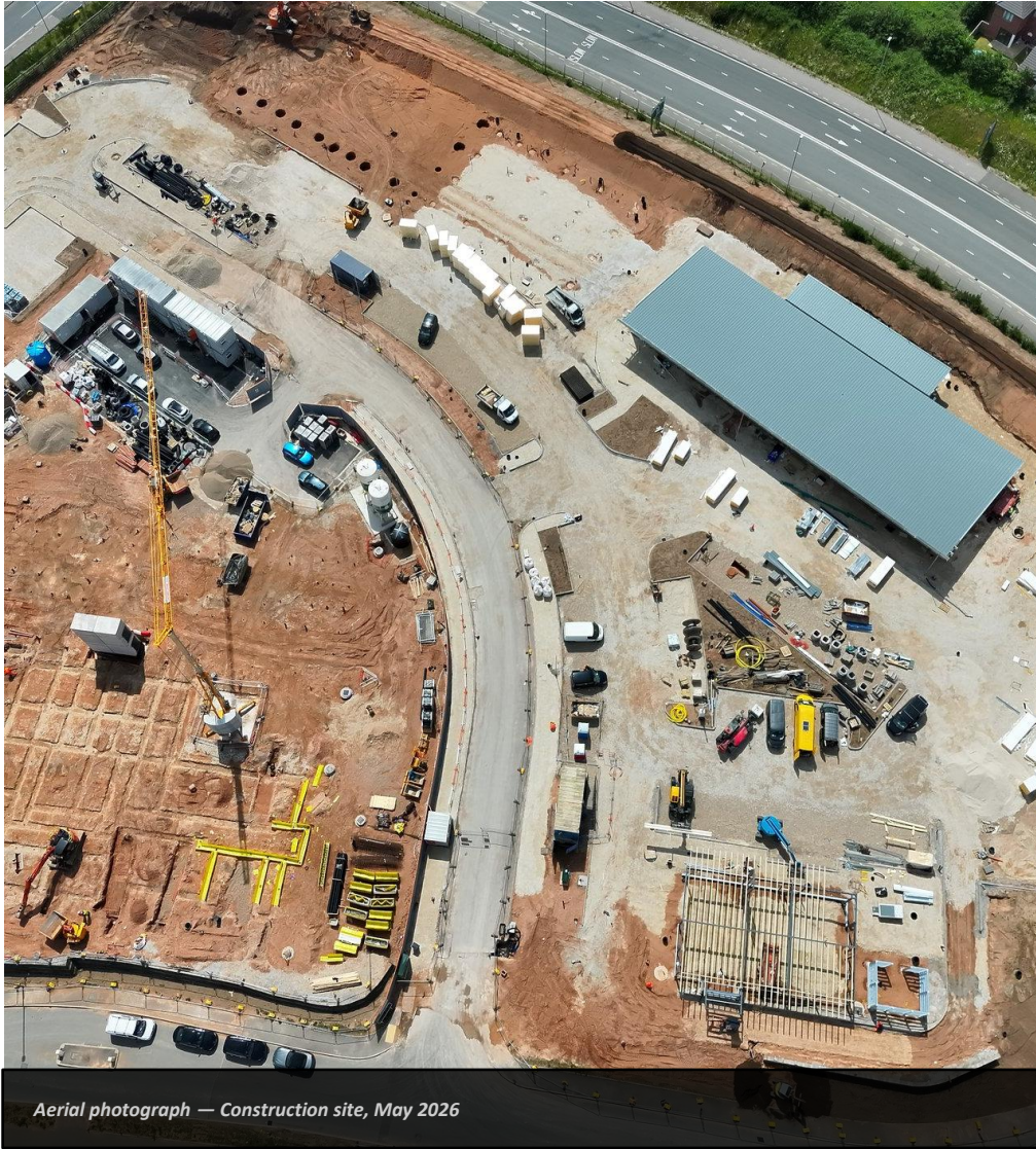
Aerial photograph — Construction site, May 2026