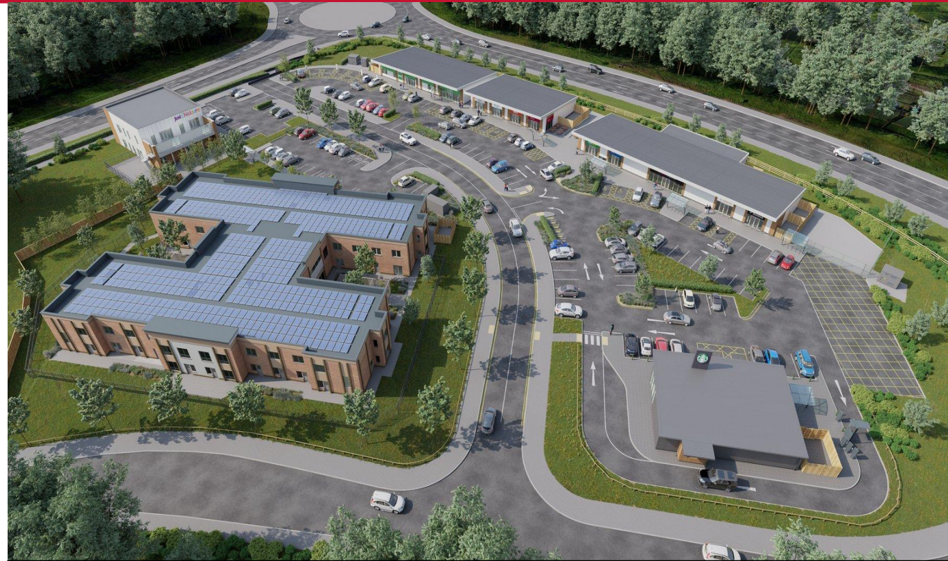
Computer generated image — indicative only