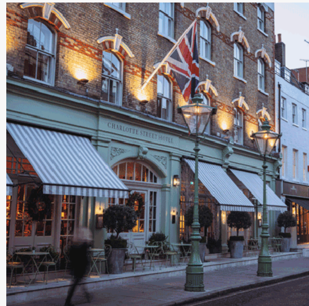
Charlotte Street Hotel