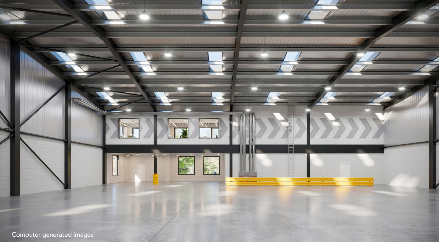
Computer generated images