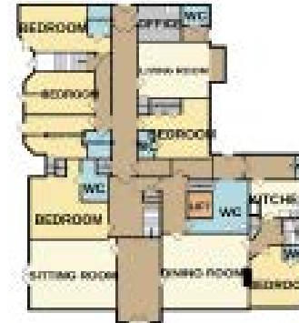
Front 3 Storey Building