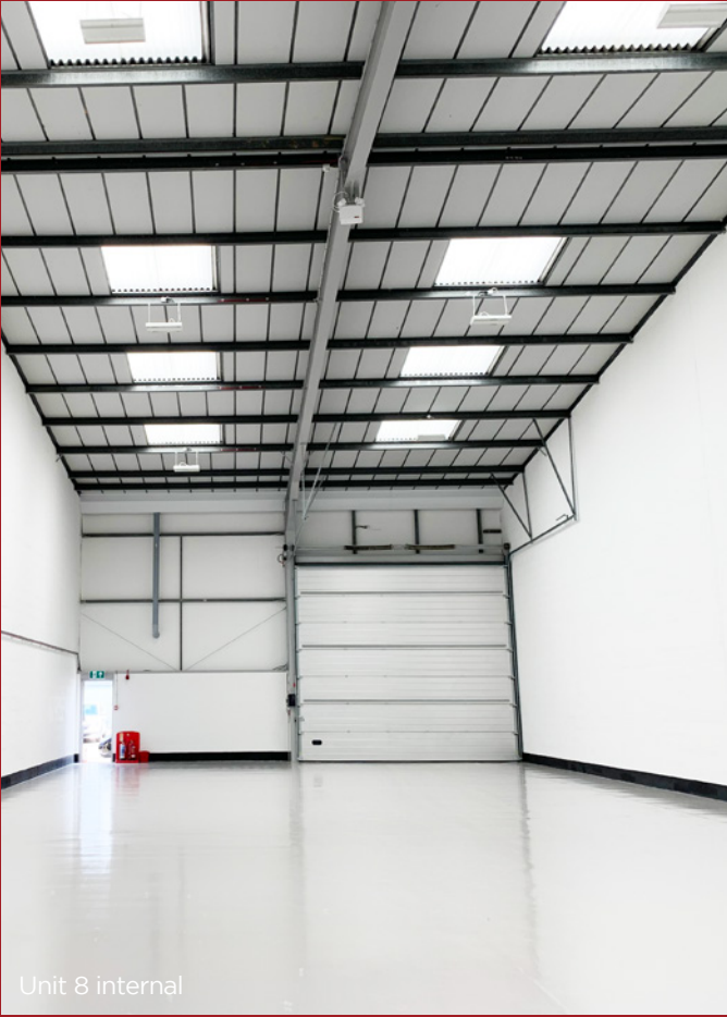
Unit 8 internal