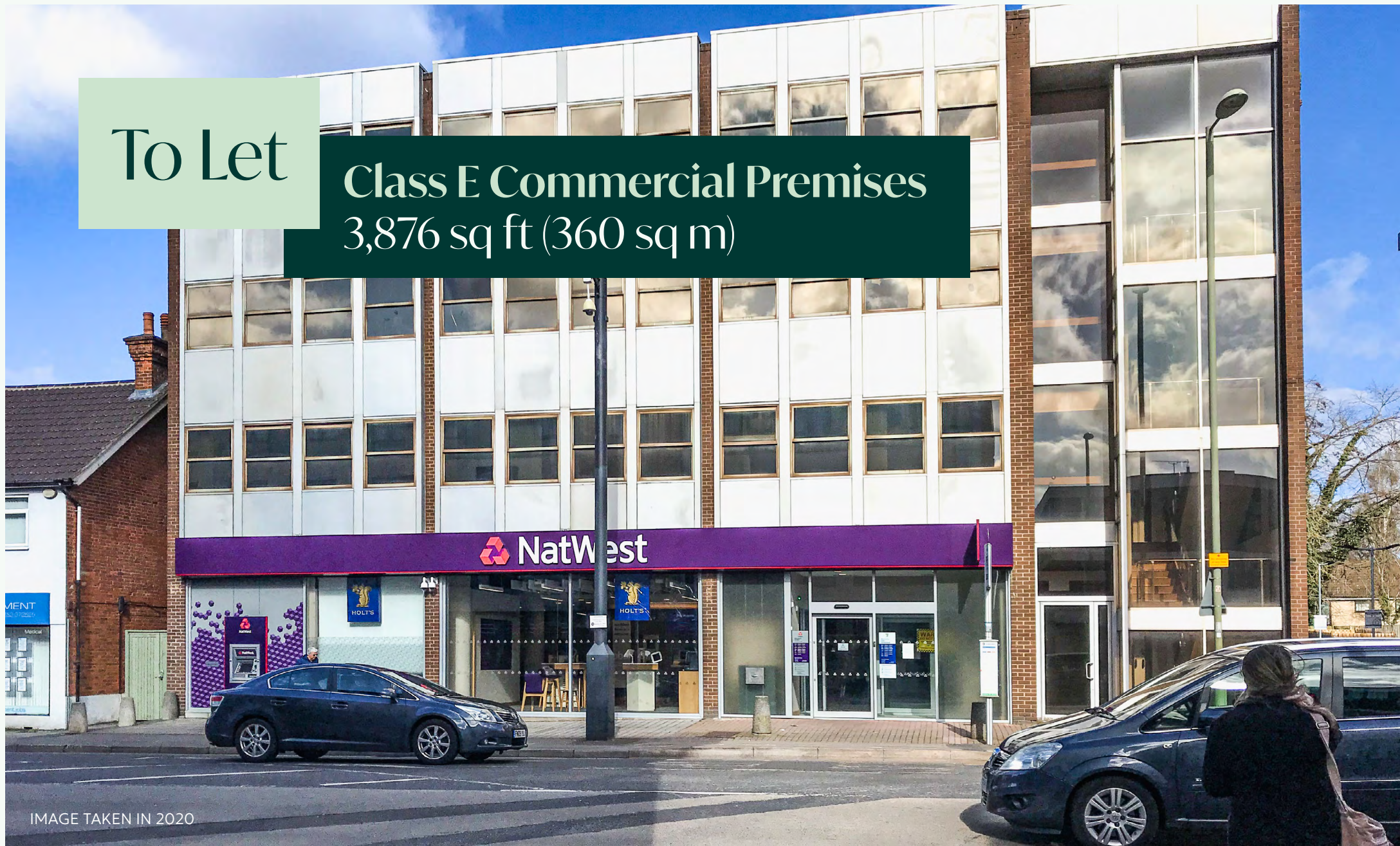
IMAGE TAKEN IN 2020

Class E Commercial Premises 3,876 sq ft (360 sq m)