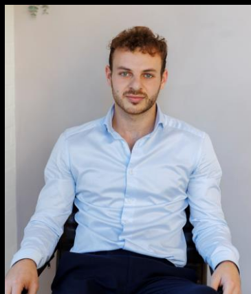
DANIEL JACKSON AGENCY dj@belcor.london 07725203254