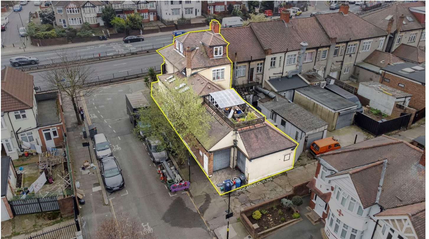
Rear of the property