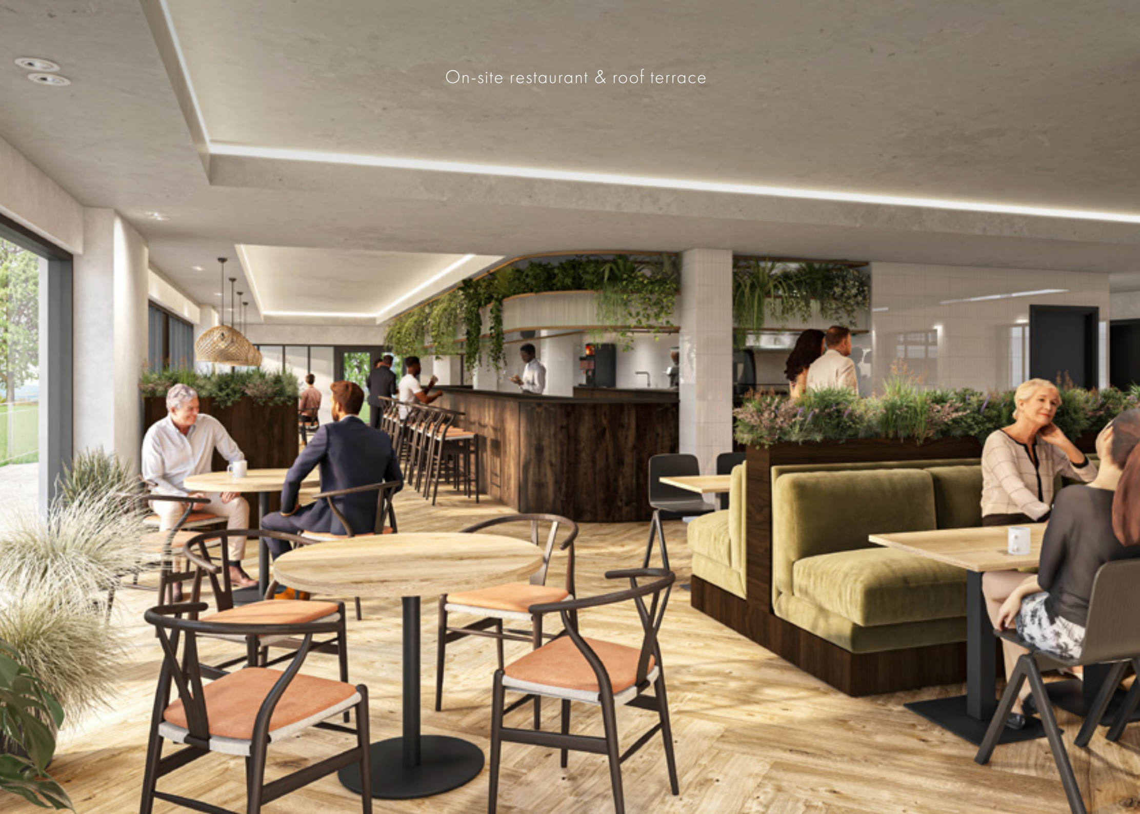
On-site restaurant & roof terrace