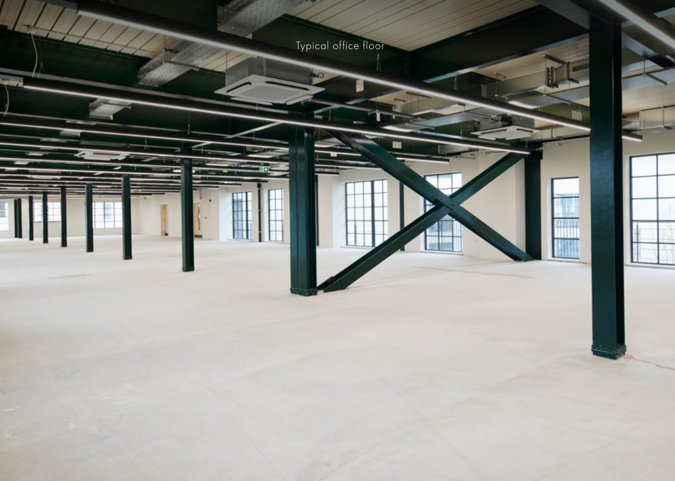
Typical office floor