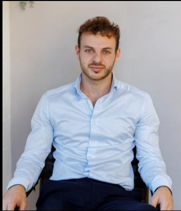
dj@belcor.london 07725 203 254