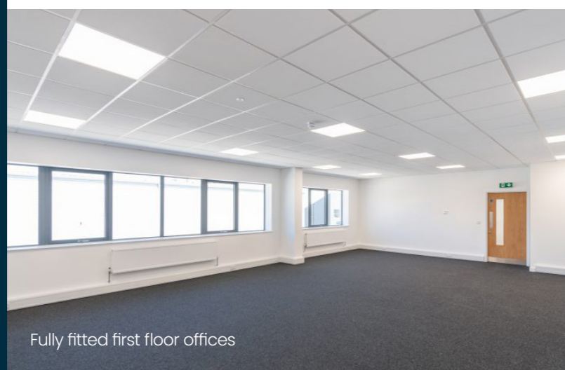
Fully fitted first floor offices