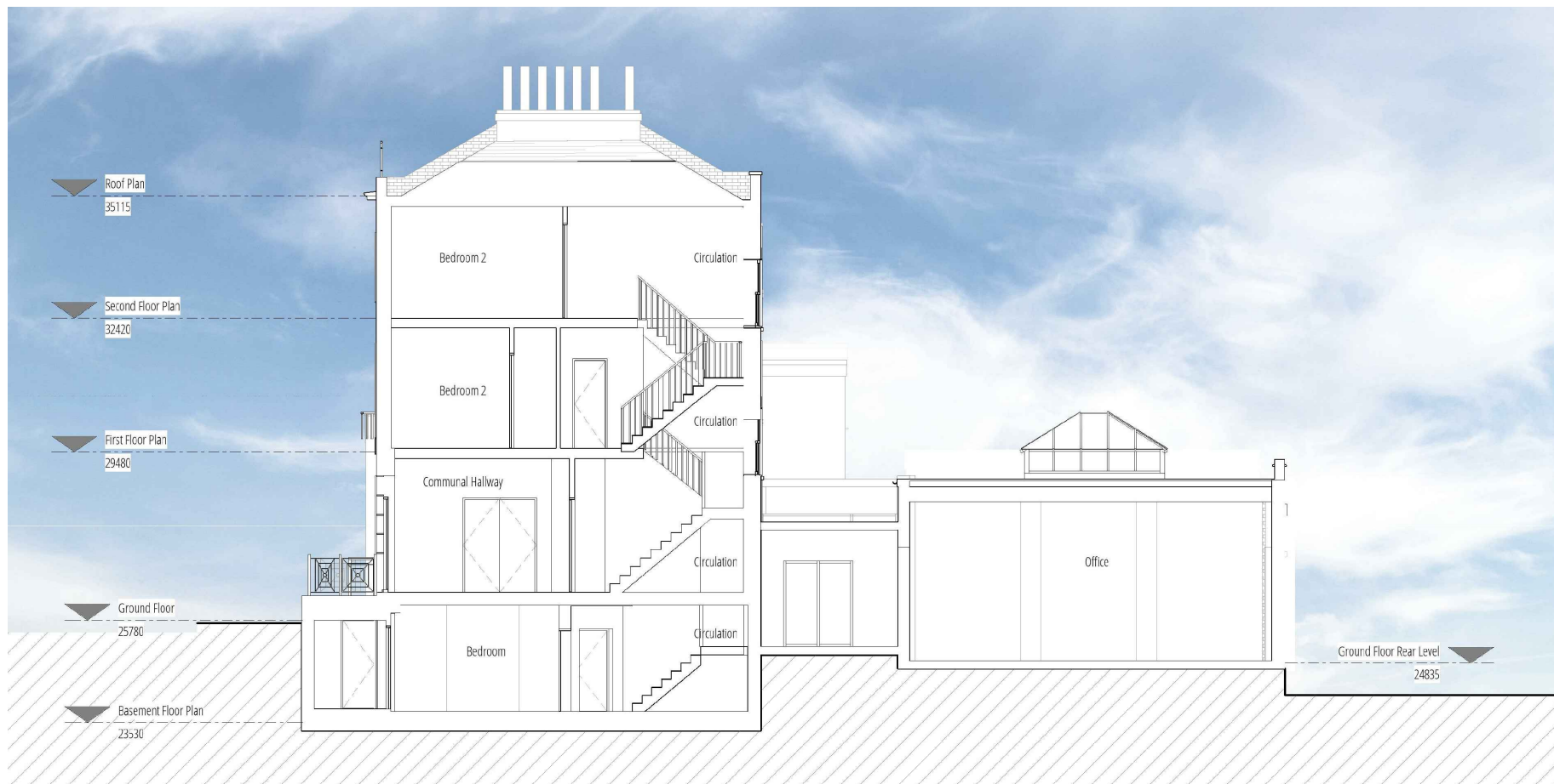
1 Existing Section CC' 1 : 100

NOTES: 1. THIS DRAWING IS COPYRIGHT AND MUST NOT BE REPRODUCED IN WHOLE OR IN PART WITHOUT WRITTEN PERMISSION OF GAA DESIGN. 2. THIS DRAWING REPRESENTS DESIGN INTENT AND CONCEPT ONLY. Hence it can be scaled for planning purposes only. 3. THIS DOCUMENT AND ALL ASSOCIATED DOCUMENTS ARE PREPARED FOR SPECIFIC SITE AND SCHEME AND INCORPORATE CALCULATIONS AND ASSUMPTIONS AVAILABLE FROM THE CLIENT AT THE TIME OF DRAFTING. 4. THE RECIPIENT AGREES TO PROTECT THE CONTENTS FROM DISSEMINATION AND DISSEMINATION EXCEPT AS REQUIRED FOR THE SPECIFIC CLIENT NAMED, WITHOUT THE WRITTEN PERMISSION OF THE DESIGNER. 5. USE OF THIS DESIGN IS GRANTED TO THE CLIENT FOR THE SPECIFIC AND NAMED EVENT ONLY. COPYRIGHT © 2019