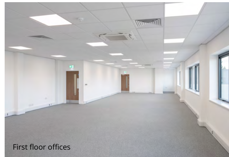
First floor offices