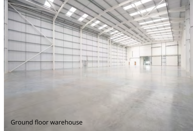
Ground floor warehouse