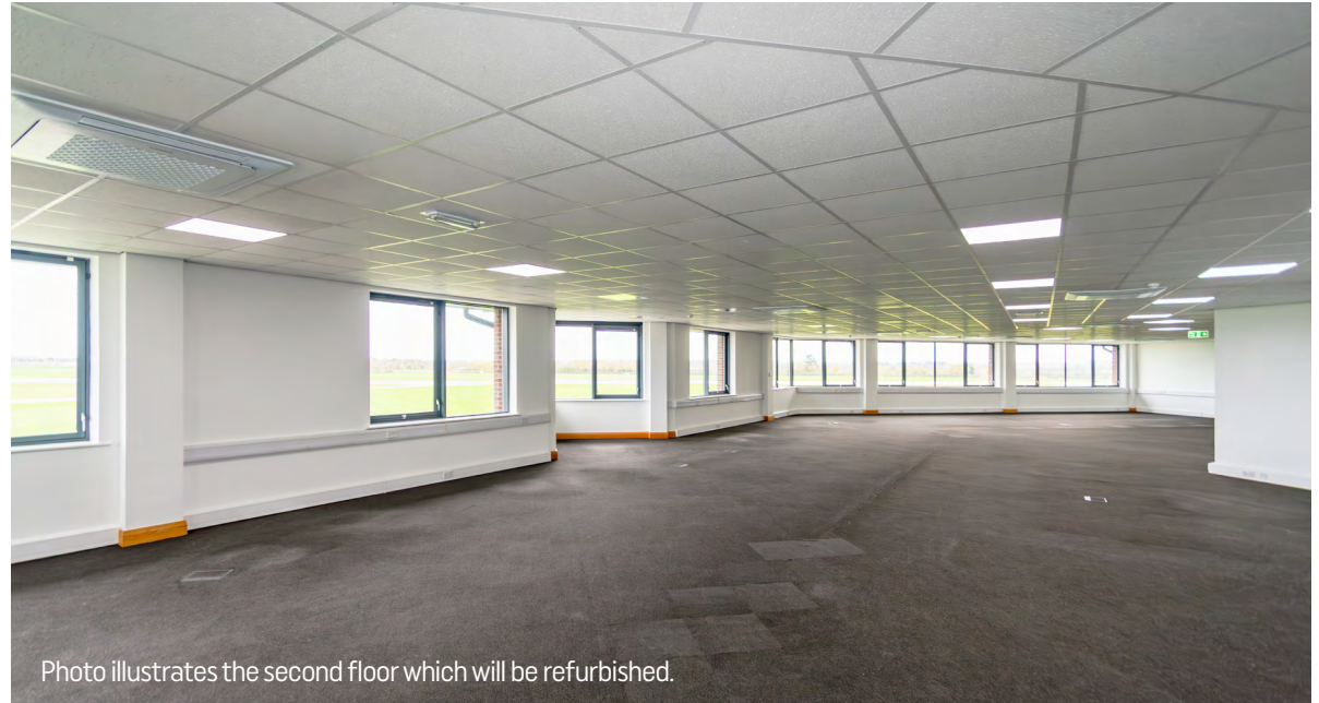
Photo illustrates the second floor which will be refurbished.

Externally, there is generous parking with the second floor allocated 28 car spaces in the car-park to the rear of the building. One of the car spaces has a dual EV charging point.