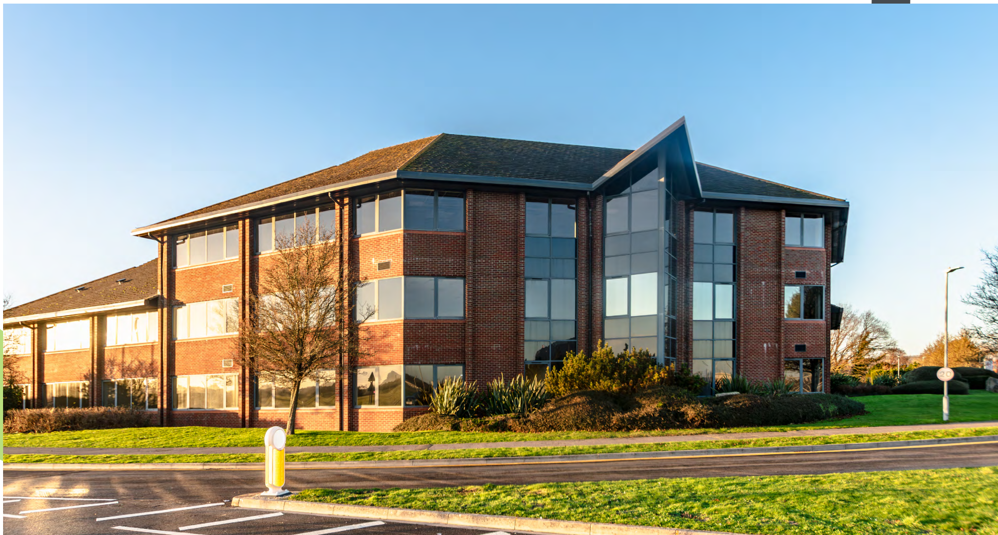
Second Floor, Loewy House, 11 Enterprise Way, Aviation Business Park, Bournemouth Airport, Christchurch, Dorset, BH23 6EW