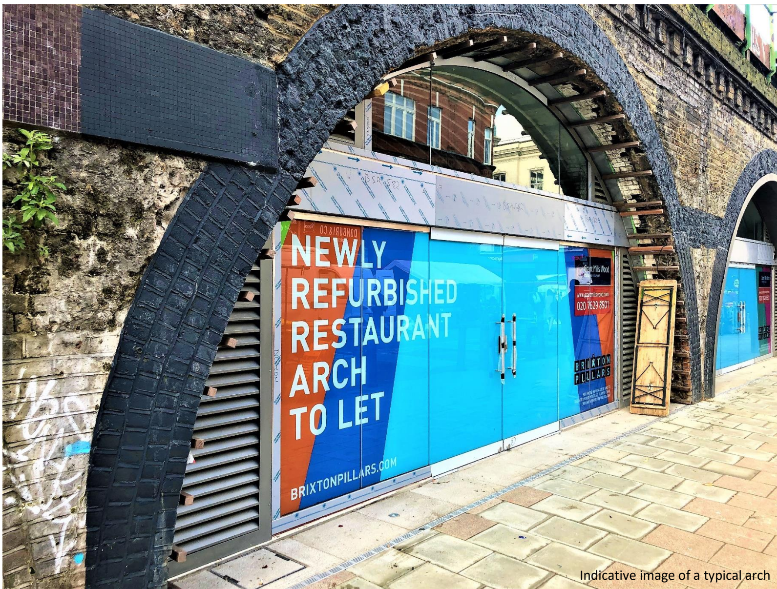
Indicative image of a typical arch

Unit 10 (Arch 575) Brixton Pillars Brixton Station Road Brixton London SW9 8HX