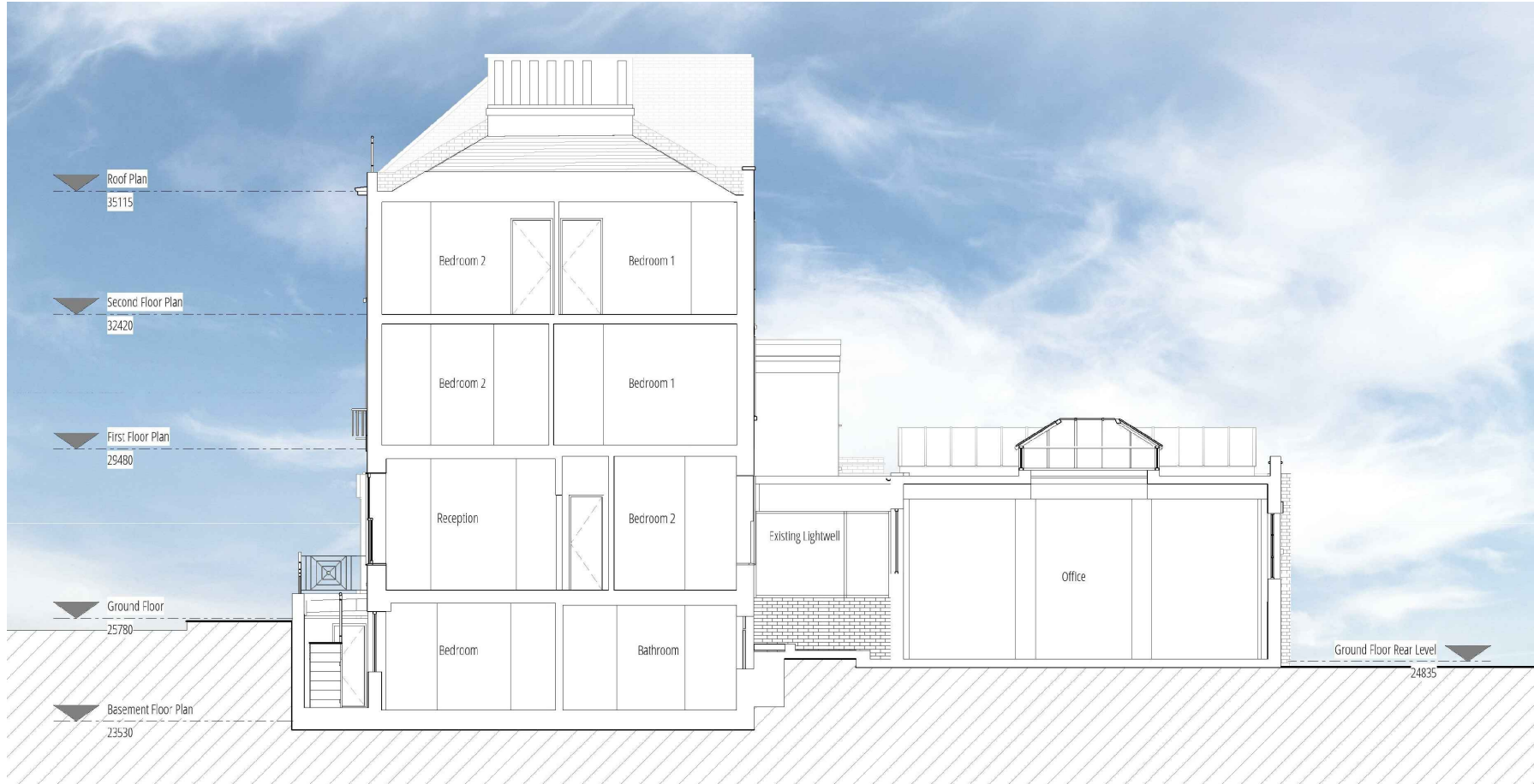
1 Existing Section DD' 1 : 100

NOTES: 1. THIS DRAWING IS COPYRIGHT AND MUST NOT BE REPRODUCED IN WHOLE OR IN PART WITHOUT WRITTEN PERMISSION OF GAA DESIGN. 2. THIS DRAWING REPRESENTS DESIGN INTENT AND CONCEPT ONLY. HENCE IT CAN BE SCALED FOR PLANNING PURPOSES ONLY. 3. THIS DOCUMENT AND ALL ASSOCIATED DOCUMENTS ARE PREPARED FOR SPECIFIC SITE AND SCHEME AND INCORPORATE CALCULATIONS AND MEASUREMENTS AVAILABLE FROM THE CLIENT AT THE TIME OF DRAFTING. 4. THE REPORT HOLDER AGREES TO PROTECT THE CONTENTS FROM DISSEMINATION AND DISSEMINATION EXCEPT AS REQUIRED FOR THE SPECIFIC CLIENT NAMED, WITHOUT THE WRITTEN PERMISSION OF THE DESIGNER. 5. USE OF THIS DESIGN IS GRANTED TO THE CLIENT FOR THE SPECIFIC AND NAMED EVENT ONLY. COPYRIGHT © 2019