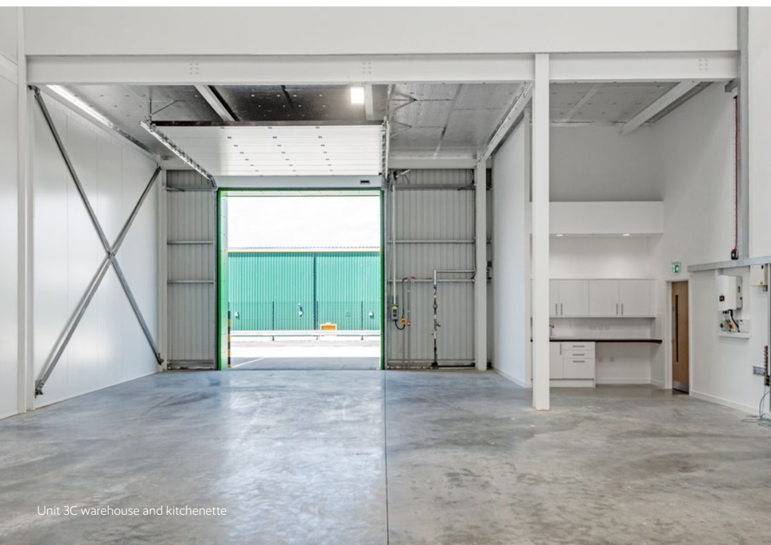
Unit 3C warehouse and kitchenette