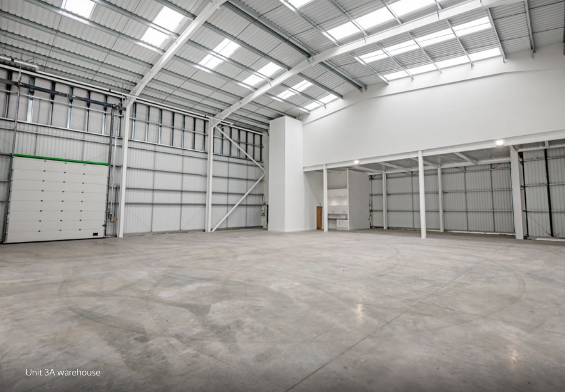
Unit 3A warehouse